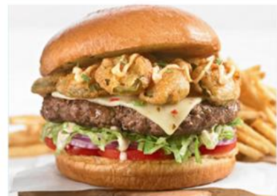
Crispy Jalapeño Burger