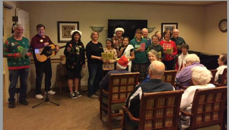
Caroling with our Sinaloa K-Kids at Sunrise Senior Living