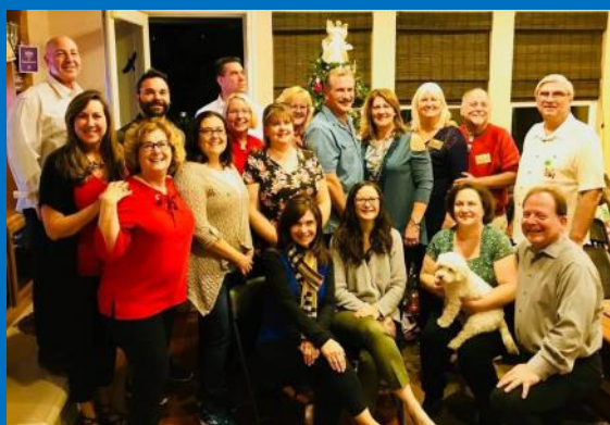
The Kiwanis Club of Moorpark 2017!