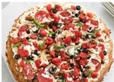
BJ's Favorite Deep Dish Pizza

Valid for dine in or take out. Not valid towards alcoholic beverages or Happy Hour specials. Please do not distribute flyers on-site during the event. Flyers must be printed and presented to the server.