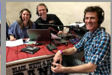
Our annual Black, White, & Blue Jeans Dance at Hummingbird Nest Ranch fundraiser was a great success, and featured a live broadcast from our friends at local country station 99.1 The Ranch.