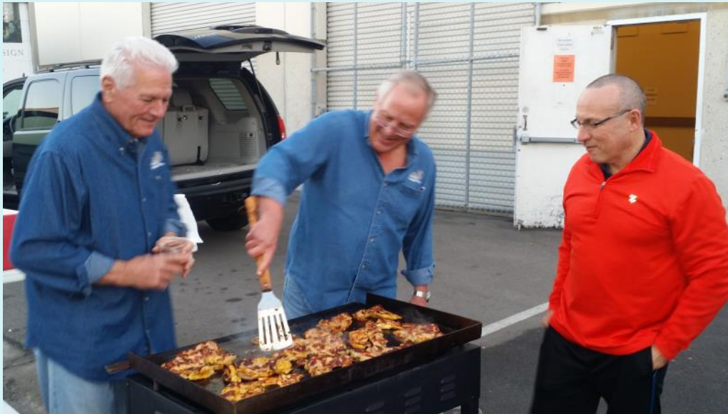
LEFT: Grilling for the January DCM