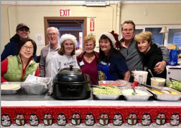
Our holiday crew feeds the homeless at the Samaritan Center.