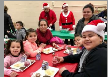
Having fun treating the kids and their families at the annual Pancake Breakfast with Santa at Berylwood Elementary School