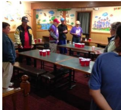
The stage is all set for 4 teams to compete in the tournament.