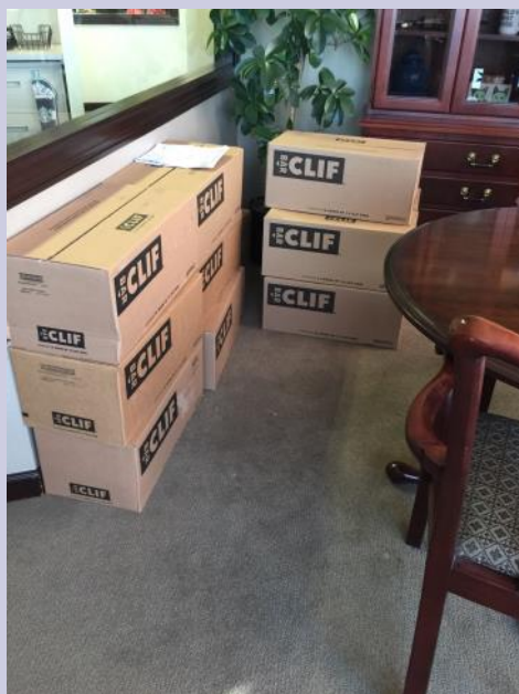
2000 Clif Bars donated to Ventura Kiwanis to benefit fire-fighters / Ventura fire by the Clif Bars company. The burning hills of Ventura.