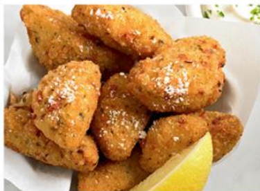
Crispy Fried Artichokes