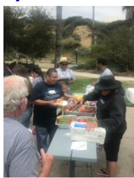
Burgers, dogs, chips, and watermelon await 200 autistic kids and volunteers.