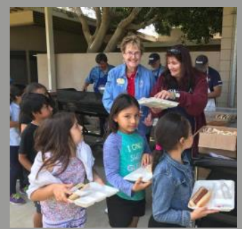
On June 6, we cooked about 500 hot dogs and helped serve lunch for Berylwood Elementary School's end of the year BBQ.