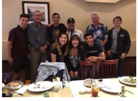
Students from CKI-UCSB charged into our Wednesday meeting with great enthusiasm and ran our meeting, then took off with the money collected!