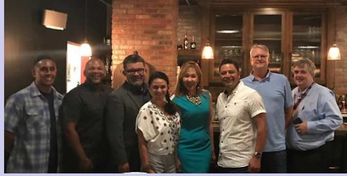
Kiwanis August social at Cocovin Restaurant in Oxnard with potential members