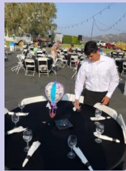
Santa Paul H. S. Key Club members volunteering at the Starlight Glow Balloon Festival