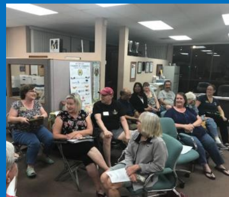
Our monthly club meetings are always informative and FUN!