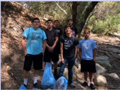
Santa Paula H. S. Key Clubbers cleaning up at Steckel Park