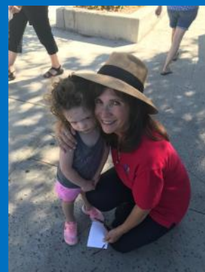
Moorpark Kiwanians volunteer at the Moorpark Educational Foundation Food Truck Meet-Up which helps support our school district.