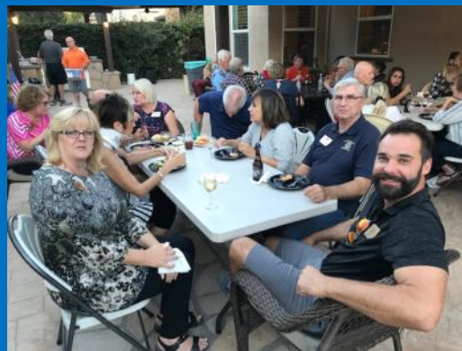
Moorpark Kiwanians were friendly party crashers at the Thousand Oaks Kiwanis Club social.