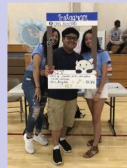
Oxnard High School's Key Club cabinet (with DLT members from Oxnard High) participating in OHS's Freshmen Orientation