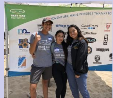
Oxnard H. S. members participating at Best Day at the Beach