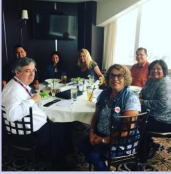
Thursday planning lunch meeting at the Tower Club