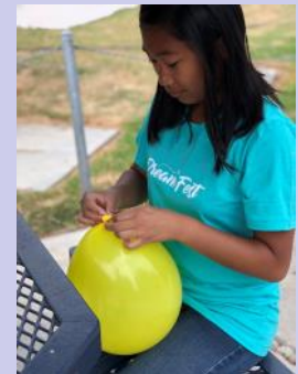
Pacifica High School Key Club members helping out at the Dream Festival with other Div. 42 West (D42W) clubs