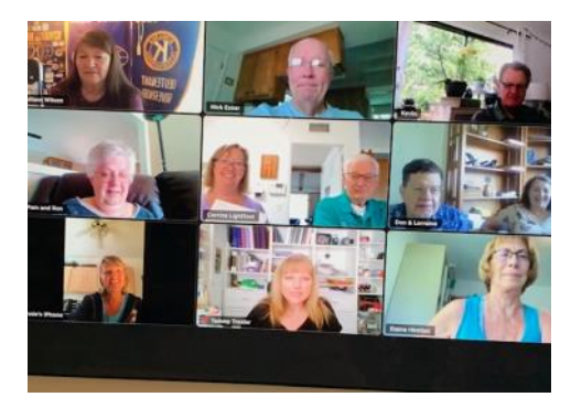
We continue to meet virtually on Zoom, but as of December all our meetings have moved to Wednesday evenings at 6:30pm. We meet every week except the second Wednesday of the month.