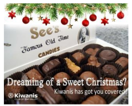
We did very well with the See's Fundraiser by opening it up to the community and providing free delivery. We sold more than $4600, and our profit was more than double what we usually do with this fundraiser.