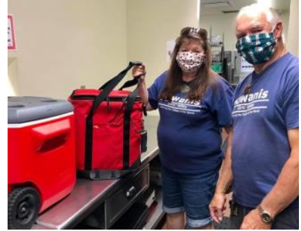
Simi Kiwanis is still volunteering to help with the delivery of overflow Meals on Wheels due to the corona-virus.