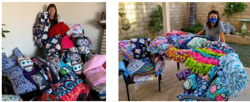
Our members are still doing tie blankets, pillows, happy bags, buddy dolls, and hospital gowns for Operation Smile, City of Hope, and foster homes.