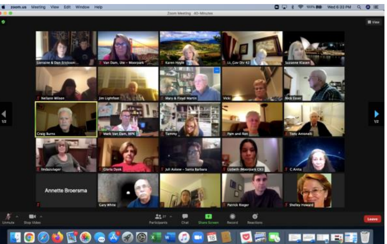
We have attended a lot of inter-clubs!