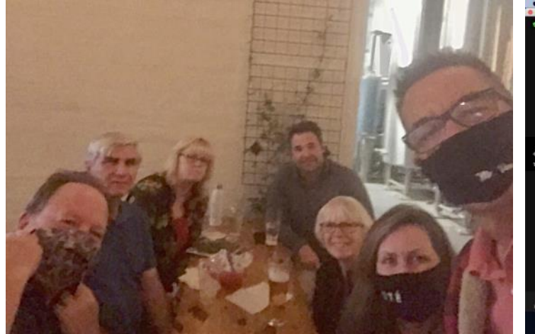
Our outdoor, masked, socially-distanced "social" at The Alley in Moorpark.