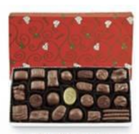
Milk Chocolates Pure milk chocolate godness. Delivered in seasonal wrap. 1 lb $24.50 #30326