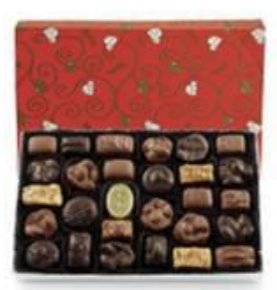
Nuts & Chews Yummy, crunchy and chewy: Delivered in sessonal wrap. 1 lb $24.50 #30334