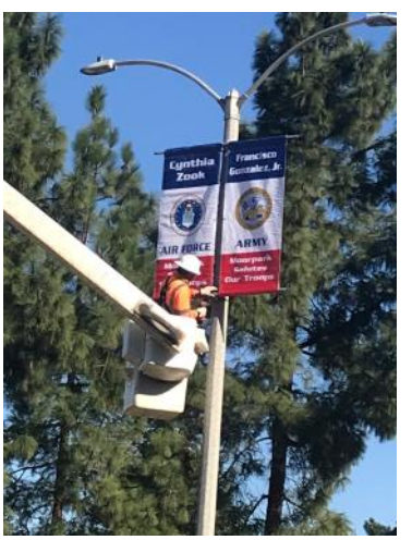
Moorpark Kiwanis organized and sponsored the Military Banner program. The banners were recently installed along Tierra Rejada.