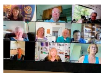
Christmas cards For The Troops; More tie blankets, pillows, happy bags, buddy dolls, and hospital gowns for Operation Smile, City of Hope, and foster homes; Zoom, Zoom!