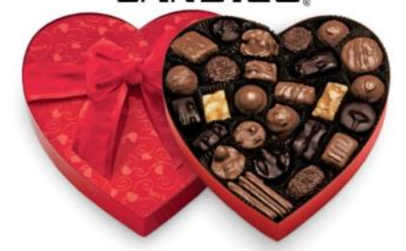
Classic Red Heart Assorted Chocolates Full of See's favorites.