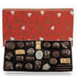
Dark Chocolates A taste of ceoso in every bite. Delivered in seasonal wrap. 1 lb $24.50 #30330