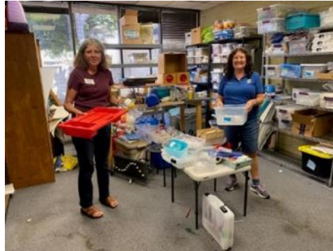
Rearranging their art supply storage