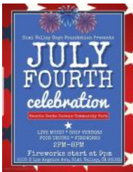
4th of July at the Park! We had a booth promoting our events, games for the kids, and a small fundraiser selling patriotic goody bags, neck coolers, and tiaras made by our members. Plus, we attracted a new member!