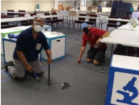
Removing studs protruding from the floor

This month we were finally able to organize a great service project at kidSTREAM. We brought along seven members, two guests, and six KIWIN'S to work alongside other volunteers to help get kidSTREAM ready for the future. There was a whole list of tasks that we worked on: