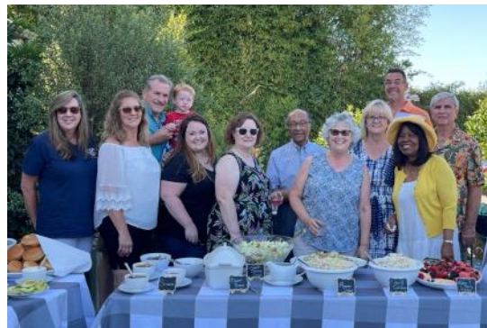
The Moorpark gang has arrived.