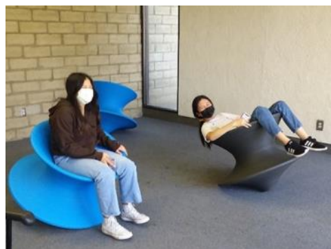
And, of course had some fun in the Magic Spun Chairs!