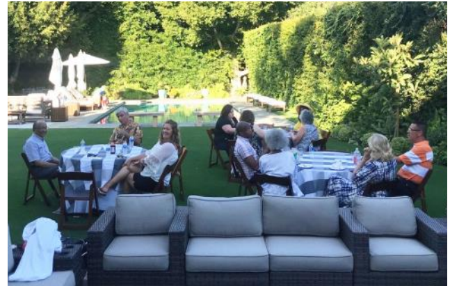
Perfect afternoon for a garden party.