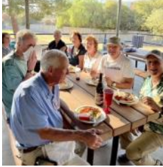
A special 5th Wednesday get-together at the train park! Potato and ice cream bars, with all the trimmings! Good times!