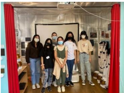
Our wonderful KIWIN'S took on: