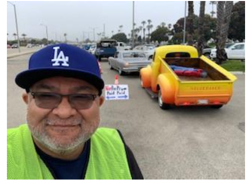
We volunteered to support the Father's Day Car Show fundraiser for Reel Guppy Outdoors and Mission Fish. Both non-profit organizations, based in Port Hueneme, CA, provide first-time fishing experiences for families. They specifically focus on foster families.