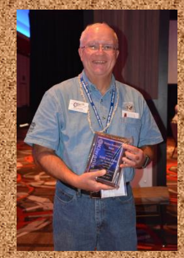
Our newsletter won Honorable Mention.