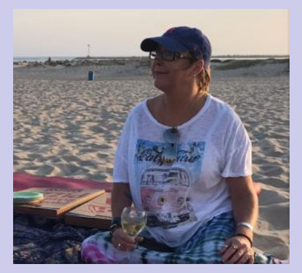
Here are a few photos of our Sunset Social Mixer at the beach.