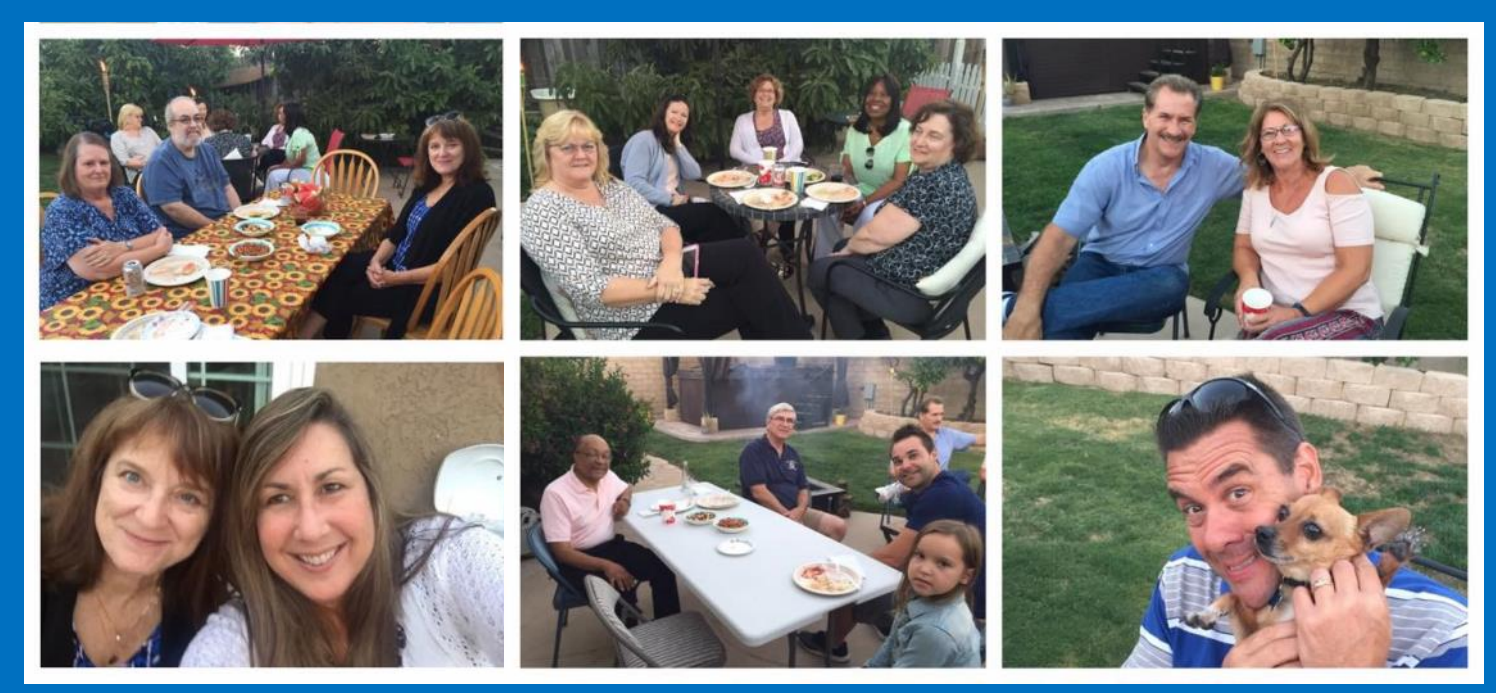
Moorpark Kiwanians having an awesome time at our monthly social meeting!