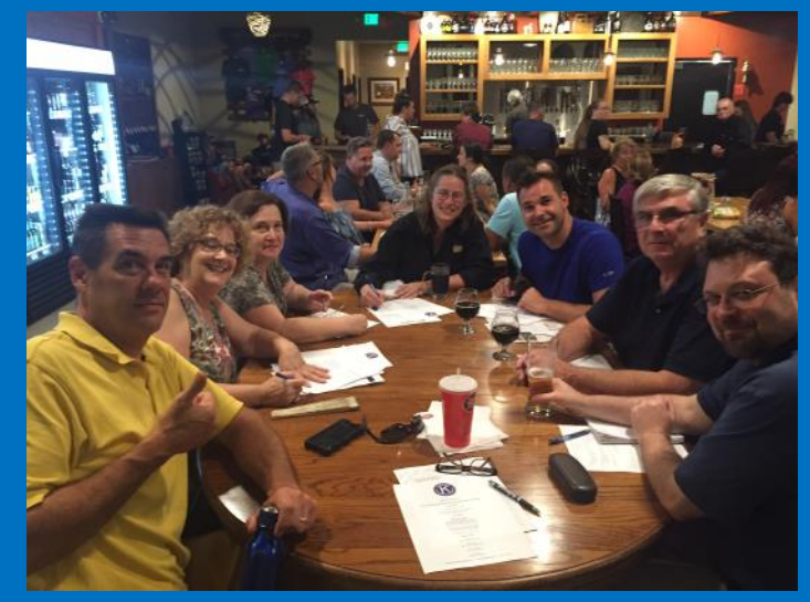
Moorpark Kiwanians are busy planning our upcoming Charity Poker Night which is on October 14 at McGregor's Craft Beer & Wine. For more information go to <a href="https://www.moorparkKiwanisPoker.com">www.moorparkKiwanisPoker.com</a>