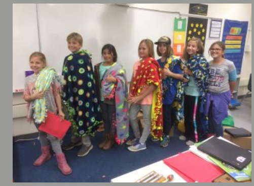
Township Elementary K-Kids made blankets for the Linus Project, for kids in hospitals.