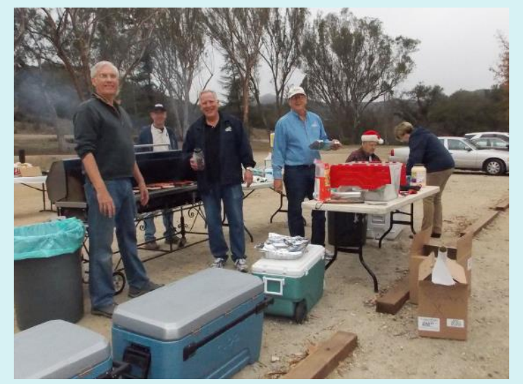
T. O. Kiwanians cook for the Ride On horse therapy program.