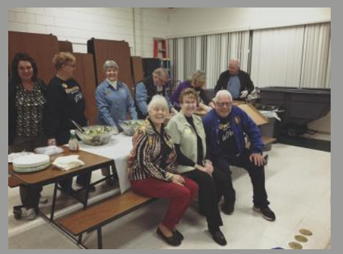
We prepare to serve food at the chartering of our 5th K-Kids Club, at Arroyo Elementary.