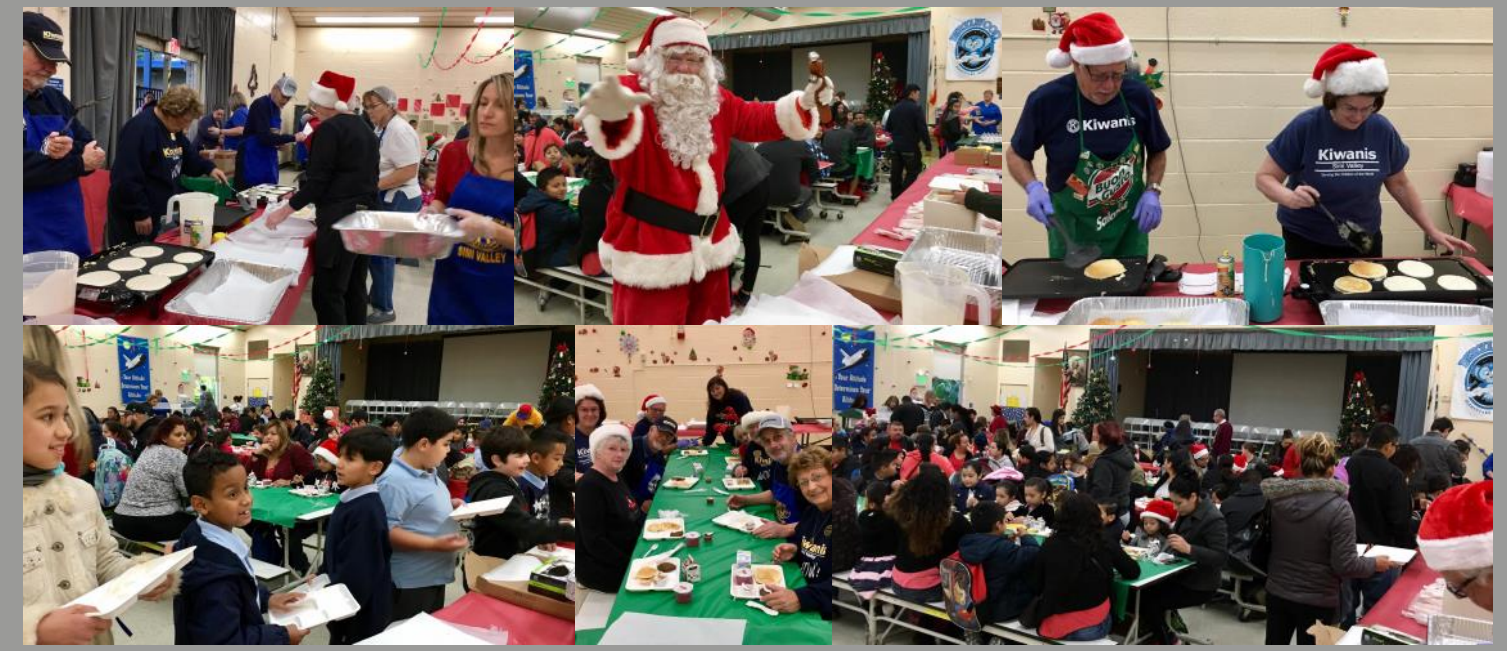
Cooking up pancakes for Berylwood Elementary students and their families is our annual contribution to this fun end-of-year event!