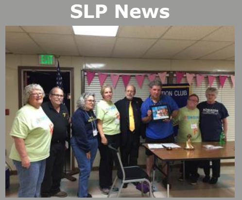
The SimiSu Aktion Club donated $2000 to Project EliMiNaTe.