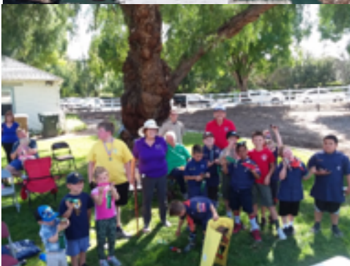
A big "thank you" from the Cub Scouts for Kiwanis continued support.