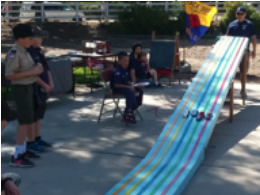
Every race was a Photo Finish

On Sunday, March 31, We joined our sponsored Cub Scout Pack for their annual Pinewood Derby. We provided the pizzas and they provided the fun. Building these cars is quite a science where they have to consider things like keeping most of the weight into the back so that it will not slow down when it hits the bottom of the slope, and raising one front wheel slightly so that it only makes ground contact on three which reduces the friction.