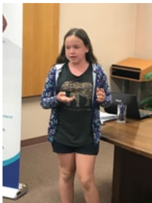
Campus Canyon Builders Club President shares all the great things their club is doing.