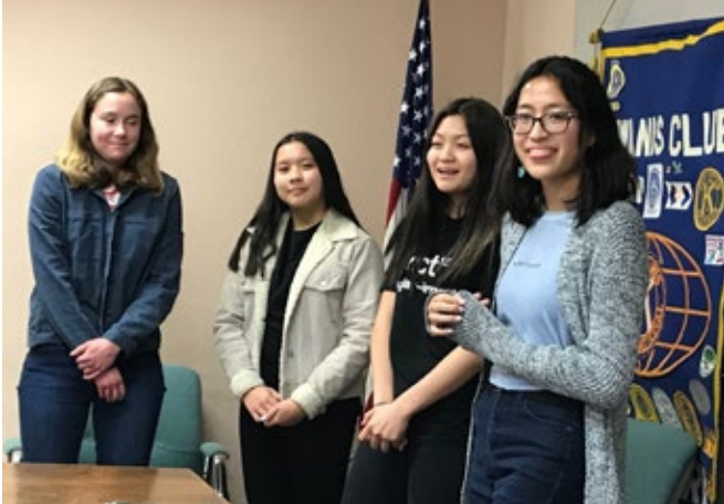
Moorpark High School Key Club officers for the 2019-2020 school year introduce themselves at our meeting.

Moorpark Kiwanis Club has awesome meetings!