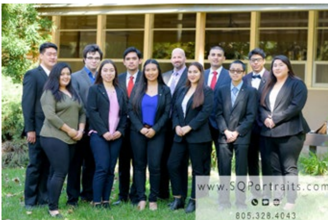
Ventura College Circle K 2018-2019 Student Board.