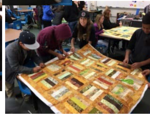
Data Builders Club, making quilts for cancer patients (4 pics)