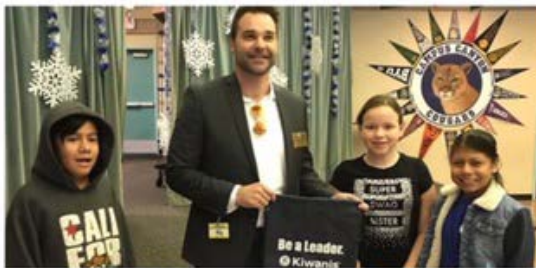
6th graders from Campus Canyon are excited to receive their “Be a Leader” bag!