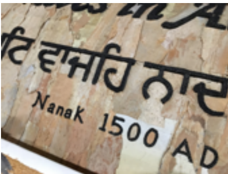
Rancho Campana KIWIN'S providing service hours at decorating the Rose Float.