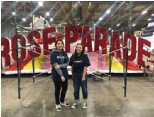
Rancho Campana KIWIN'S providing service hours at decorating the Rose Float.