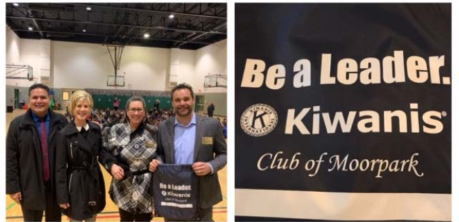
Mesa Verde Middle School 6th graders receive a “Be a Leader” bag from Moorpark Kiwanians.