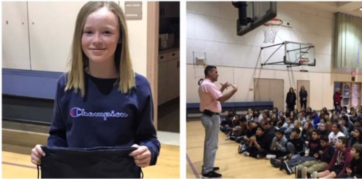
Mesa Verde Middle School 6th graders receive a “Be a Leader” bag from Moorpark Kiwanians.

Moorpark Kiwanians are eager to launch a new project where we are adopting every 6th grade student in our city and giving them a “Be a Leader” bag to carry their gym clothes or school supplies. Our goal is to make this an annual project and eventually, every student in our city will have received this useful gift from our club.