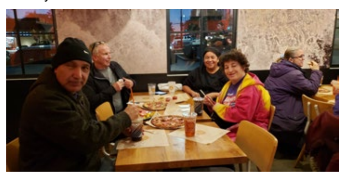
This fundraising activity was in lieu of a regular Thursday meeting. We like to mix it up!!