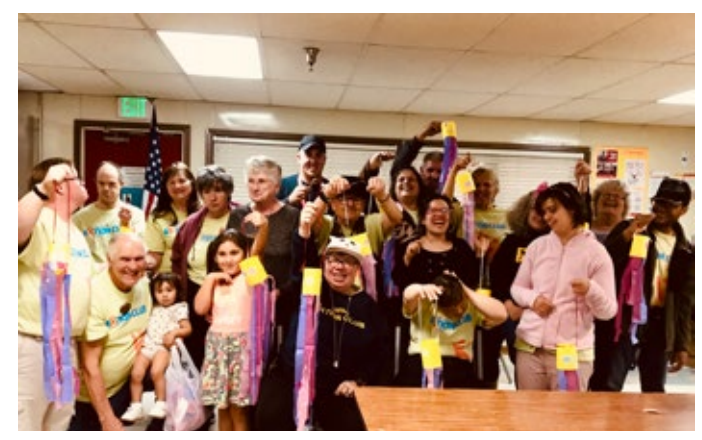
Fun evening with the Aktion Club! They are getting ready to Volunteer at Round Up, make decorations next month for the Senior Easter Breakfast... and all excited about the Student Leadership Picnic!