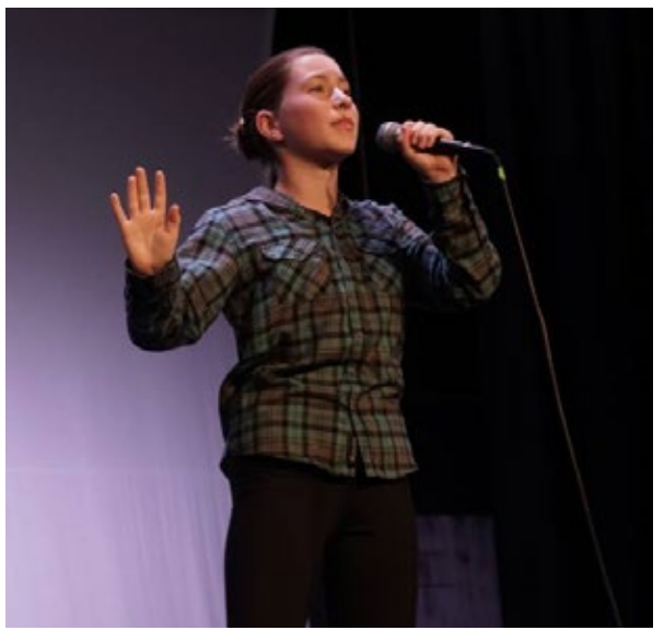
Festival of Talent Auditions - FOT is March 23rd at Ventura H.S