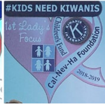
Some of our Members attended the Mid Year Convention!