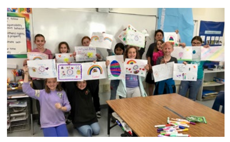
Our Township Elementary K/Kids made placemats for the upcoming Senior Easter Breakfast!