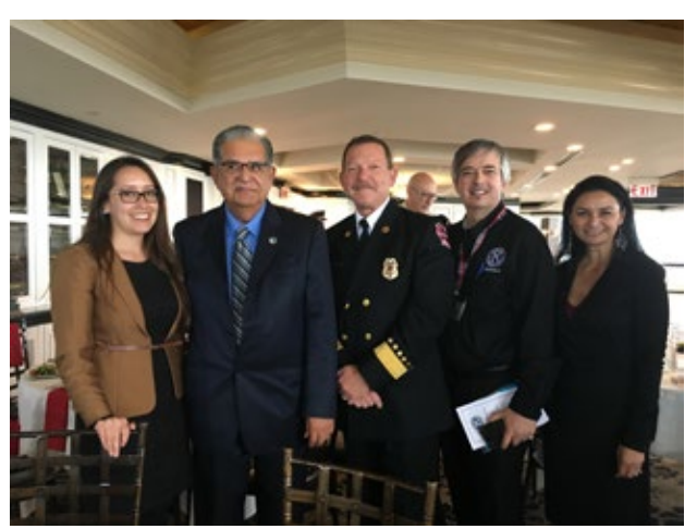
InterClub visit with Camarillo club March 14