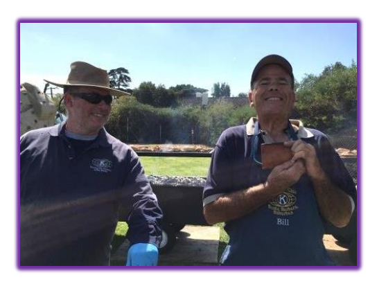
Kiwanis members take the time to serve over 200 students, parents and volunteers on another beautiful day in Santa Barbara.