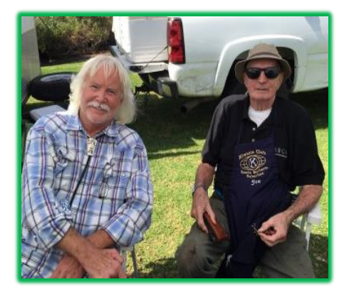
Last year it was over 105 degrees for this BBQ which almost did everyone in. But this year it was only in the 80's, so everyone is all smiles!