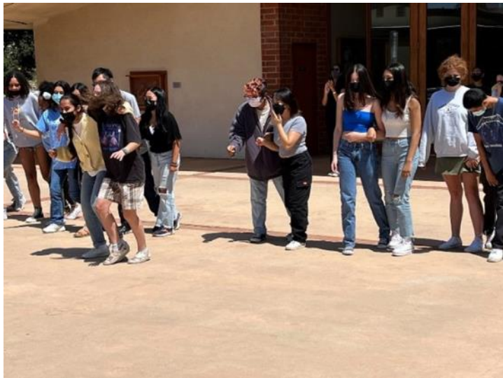
Three-legged Red Light/Green Light