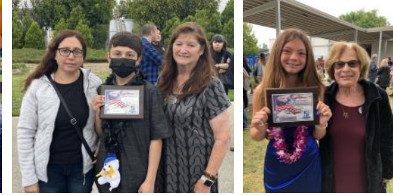
Hope of America awards were given to outstanding youths from 23 elementary and middle schools.