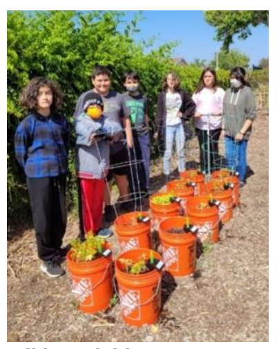
Builders Club's Learn & Grow project is progressing.