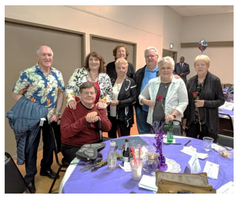
Not All Work and No Play Good friends from Santa Susana and Simi enjoyed an evening out in Santa Monica for dinner, and even some dancing.