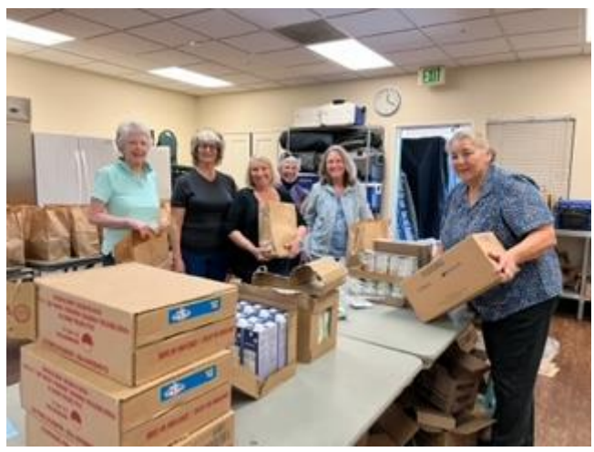
Members of the Ventura Club assist at the Salvation Army, helping to get food to the people of Ventura.