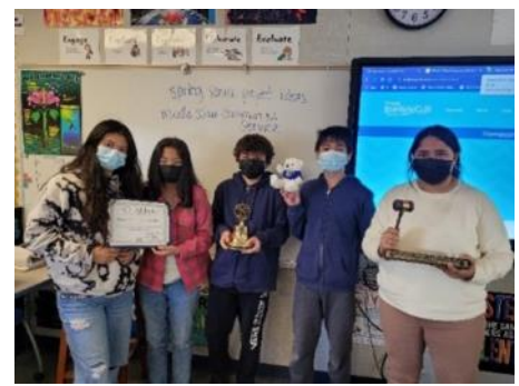
University Preparation Charter School Builders Club celebrating their Charter Day