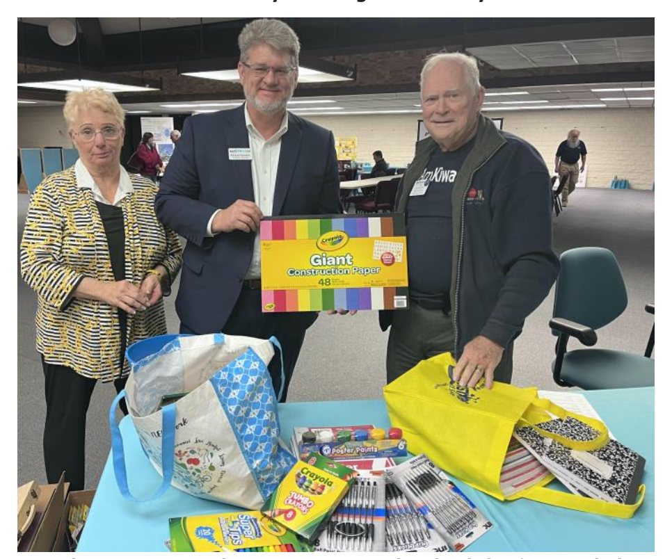
At the DCM on March 10, we presented a check for $800 to help purchase TVs for the kidSTREAM building and contributed school supplies to support homeless kids in programs at Noah's Anchorage in the Santa Barbara area and School on Wheels in the Ventura area.