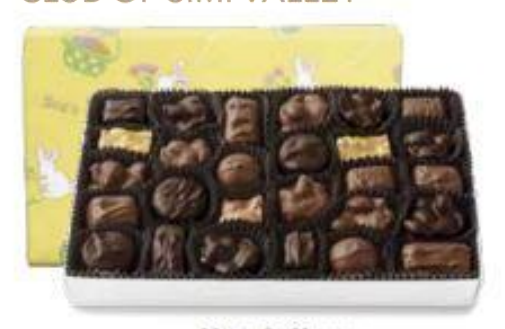
Nuts & Chevrs Yummy, crunchy and chevy. Delivered in seasonal wrap. 1 b $26,50 p40334