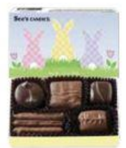
Hoppy Surprise Box Full of See's favorites. 3.5 oz $9.50 #8693