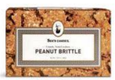
Peamut, Brittle Buttery, crunchy and irresistible. 1 lb 8 oz $27.00 #355