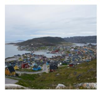
HAL - Why We Sail

Cruise to Greenland and Iceland roundtrip Boston as part of an extraordinary voyage with stops in Newfoundland, Labrador, Novia Scotia and Bar Harbor. Glide the nature-rich Prince Cristian Sound and otherworldly Icelandic fjords.