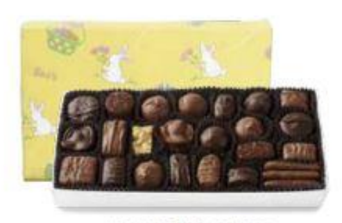
Assorted Chocolates Milk and dark decadence. Delivered in seasonal wrap. 1 lb $26.50 #40318