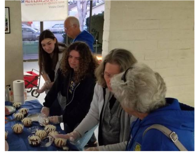
Members of both the Ventura Kiwanis and the Ventura High School Key Club prepare desserts for the March DCM.