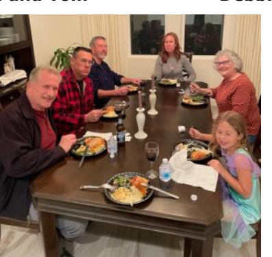
Fun, fun, fun!