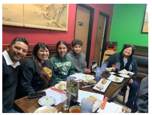
Our February general meeting was held at Sushi-Ichi 805 in Port Hueneme and included Key Club members.