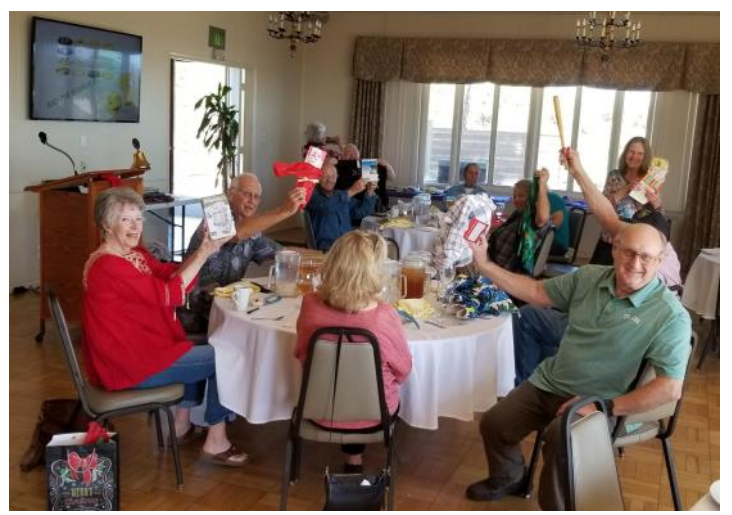
Kiwanians from Ventura show their treasures from the club's white elephant gift exchange in February.