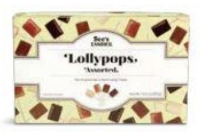
Assorted Lollypops Vanila, Butterscotch, Café Latté and Chocolate. Approximately 30 follypops. 1 to 5 oz $27.00 #296