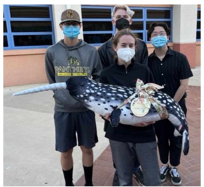
Division 42 East's Mighty Narwhal mascot in the loving care of the Newbury Park High School Key Club