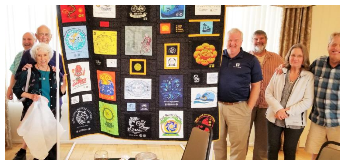
In March, some creative members unveiled a quilt that represents the years of the "Cool Breeze" bike ride, an annual summer event that the Kiwanis Club of Ventura has organized for over 20 years.