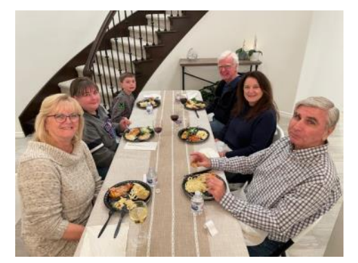
Great food, great friends.