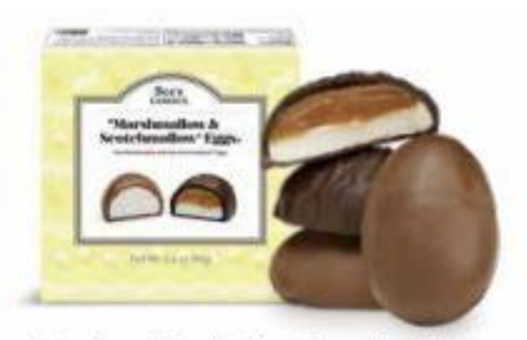
Marshmailow & Scotchmallow Eggs One box, four yummy eggs. 3.4 oz $8.50 #9493

It's time to order Sweets for all of the SWEETIES on your list. Deadline to order is March 31. We will deliver to your Simi Valley or Moorpark address FREE. Candy is the SAME PRICE AS THE STORE and all proceeds benefit kids in Simi Valley through a variety of Scholarships! It's a Win - Win! Order Here