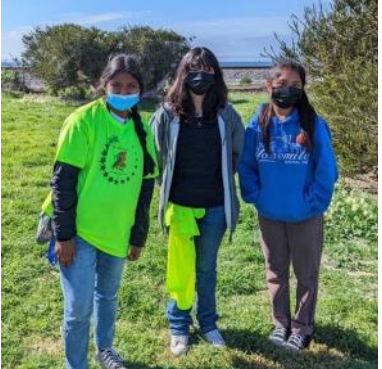
Key Club and KIWIN'S members at Seaside Marathon, Ventura