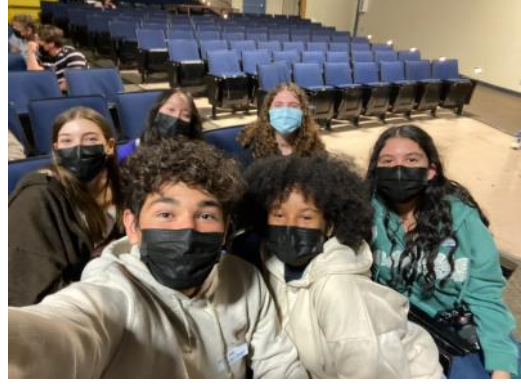
Key Club Div. 42 East & West Conclave at Oxnard High School