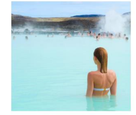
Kiwanis Fund Raiser