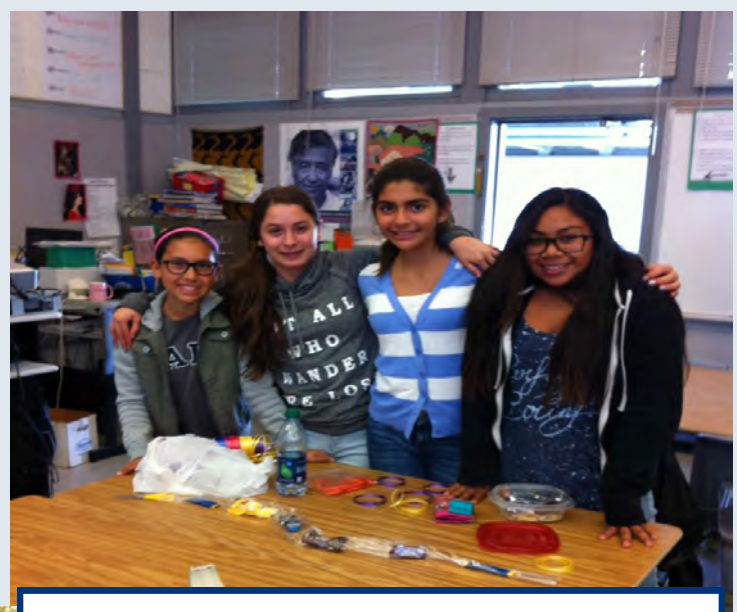
Builders Club at Anacapa Middle School work on Holiday Project