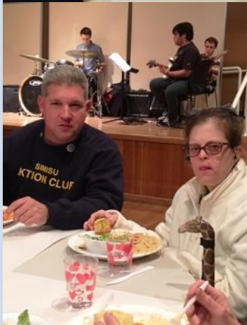
Key Club of Santa Susana High, with assisted efforts from KSS, Key Club of Royal High, and other amazing volunteers, put on a Spaghetti Dinner fundraiser to help Key Club members raise funds for leadership training and one of the pediatric program funds! Attendees had the pleasure of listening to some great jazz performed by talented musicians from Santa Susana High.