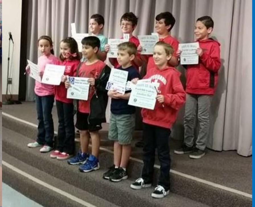
Kiwanis Terrific Kids at Peach Hill Elementary School--let's celebrate our "Influential" and "Friendly" students!