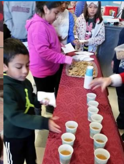
Time for chocolate chip cookies after receiving Moorpark Kiwanis Terrific Kids Awards for being Respectful and Responsible at Flory School.