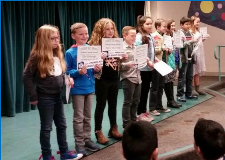
Kiwanis Terrific Kids awards these "Influential" and "Friendly" students at Walnut Canyon School!