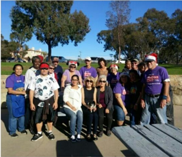
Aktion Club members enjoyed their First Annual Picnic in the park.