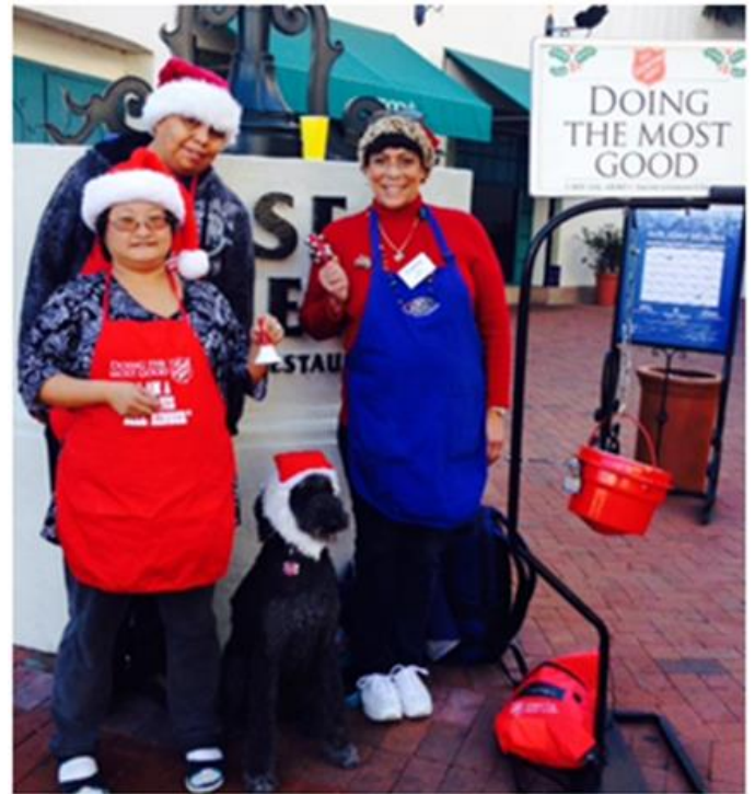
Aktion, CKI and Kiwanis Club members teamed up to cover 32 slots of bell ringing for the Salvation Army during the month of November and December.