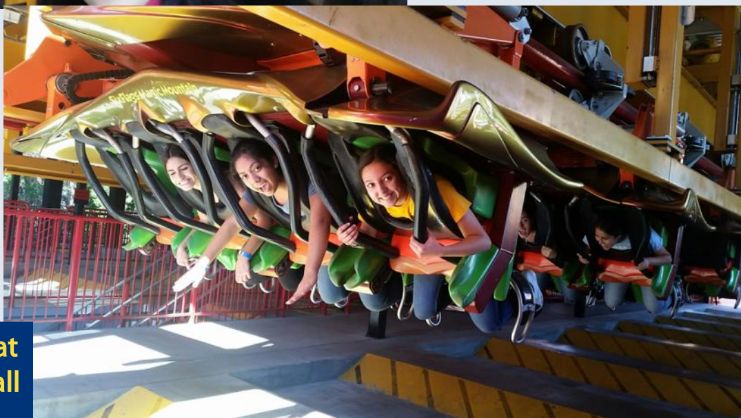
Key Club having fun at Magic Mountain at Fall Rally