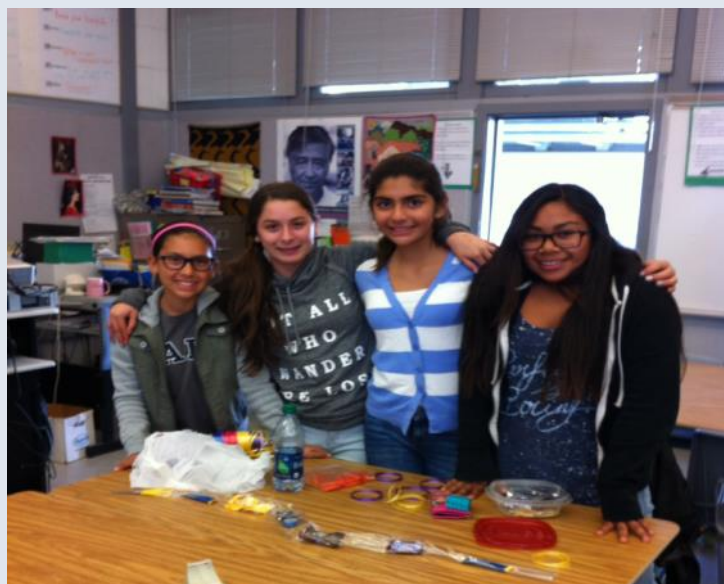
Builders Club at Anacapa Middle School work on Holiday Project