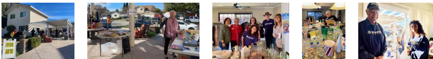
Our Mega Garage Sale turned into a 2-day affair, but netted our club some mega-cash!