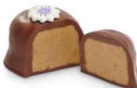
Peanut Butter Egg An irresistible treat. 3 oz $8.50 #509499