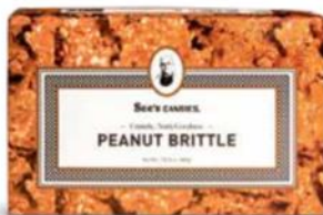
Peanut Brittle Buttery, crunchy and irresistible. 1 lb 8 oz $30.00 #500355