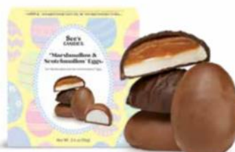
Marshmallow & Scotchmallow® Eggs One box, four yummy eggs. 3.4 oz $9.25 #503321