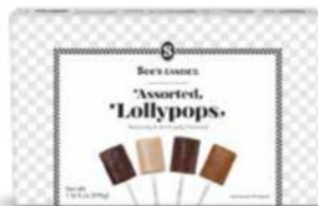
Assorted Lollypops Vanilla, Butterscotch, Café Laté and Chocolate. Naturally & artificially flavored. Approximately 30 lollypops. 1 lb 5 oz $30.00 #506543