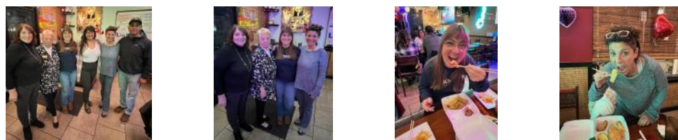
Several of our members attended the Division Social hosted by the Oxnard club, and enjoyed the Japanese food!