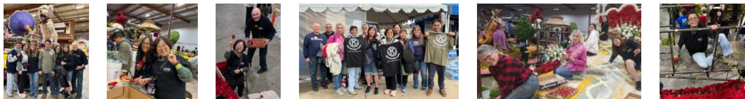
On December 30, a group of Simi Kiwanians and friends volunteered to decorate Rose Parade floats.