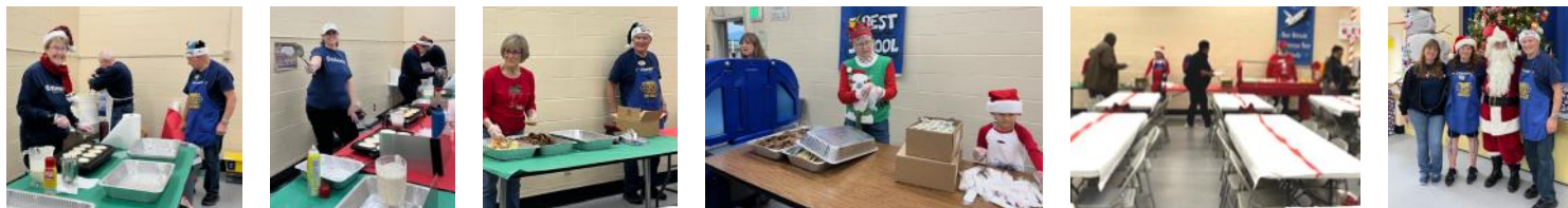
At Berylwood Elementary's Breakfast With Santa, we made about 3,000 pancakes, and did it in an hour and a half!