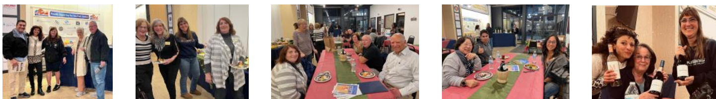
Our quarterly social meeting featured a wine and cider tasting, presented by San Antonio Winery of Los Angeles.