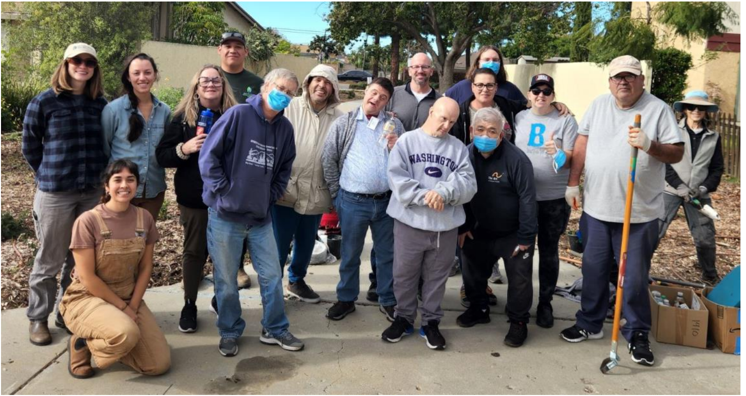
The Aktion Club of Ventura is at it again. They helped to beautify the walking path at Arneill Ranch Park in Camarillo. The group helped to remove overgrown weeds and plant new shrubs for the park visitors to enjoy. Next they will be off the help the Bessant Hill School in Ojai with their planting needs.