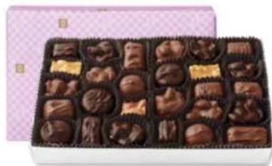
Nuts & Chews Yummy, crunchy and chewy. Delivered in seasonal wrap. 1 lb $29.50 #540334

Order for yourself or send a sweet treat to someone special in Simi Valley or Moorpark! FREE DELIVERY!