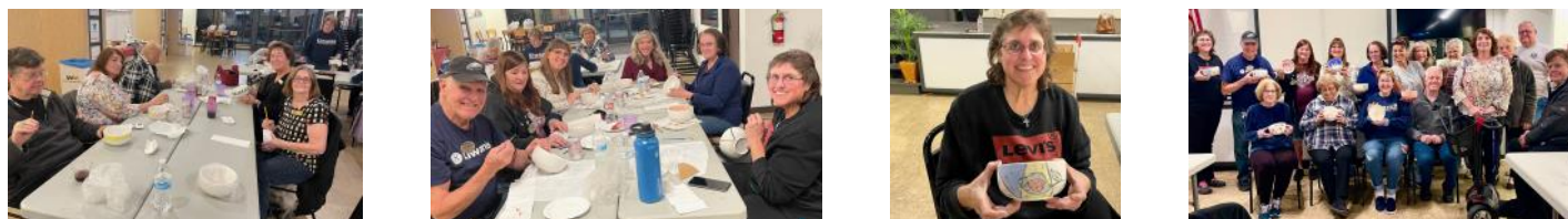
On February 12, we held a bowl-painting party for Many Mansions. They fire and sell the bowls to raise money.