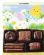
Happy Chick Assortment Full of See's favorites. 3.6 oz $11.00 #507951