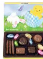
Bunny & Chick Box Beloved See's Classics. 4.8 oz $12.50 #507952