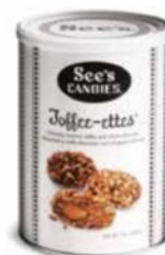
Toffee-ettes® Crunchy toffee, milk chocolate and almonds. 1 lb $29.50 #500316