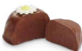
Chocolate Butter Egg Creamy and delicious. 3 oz $8.50 #509500