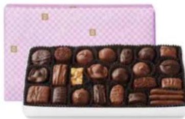
Assorted Chocolates Milk and dark decadence. Delivered in seasonal wrap. 1 lb $29.50 #540318