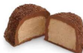
Bordeaux™ Egg A tasty classic. 3 oz $8.50 #509501