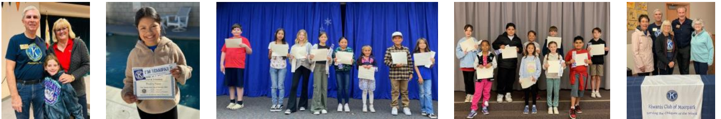
Moorpark has TERRIFIC Kids and TERRIFIC Moorpark Kiwanians!