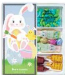
Easter Friends Box An array of adorable bites. 7.5 oz $12.50 #508694