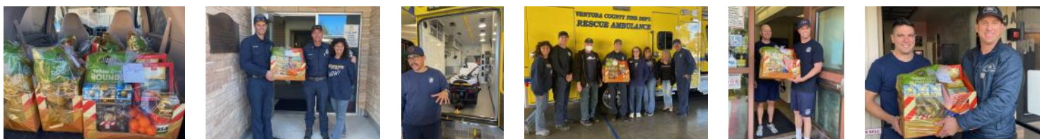
Happy New Year, first responders! On January 6, we delivered goody baskets to our local police and fire stations.