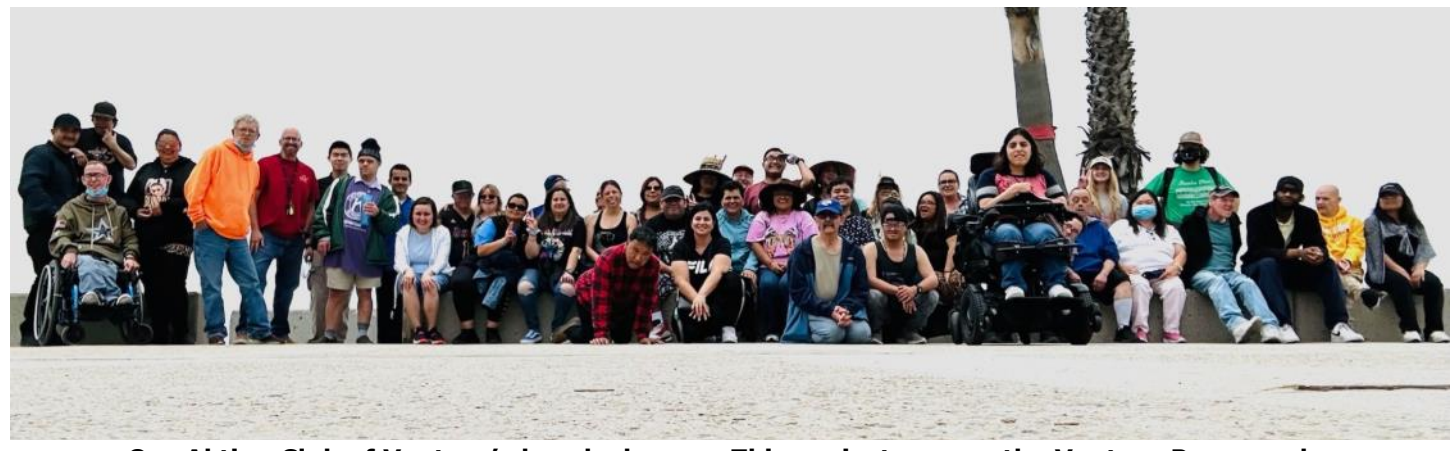
Our Aktion Club of Ventura's beach cleanup. This project was on the Ventura Promenade. About 45 people showed up to help clean up the beach and surrounding areas.