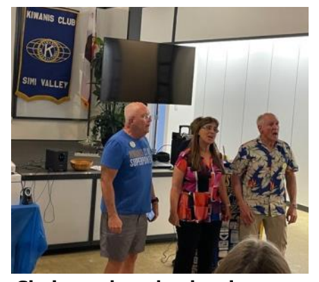
Simi members lead us in song.