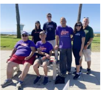
Both Kiwanis and Aktion Clubs volunteered at the Fiesta Children's Parade to hand out ice cream to participants.