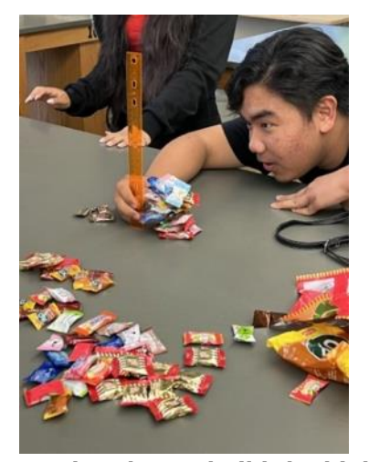
Icebreaker to build the highest pile of candy - Gov. Luci won!