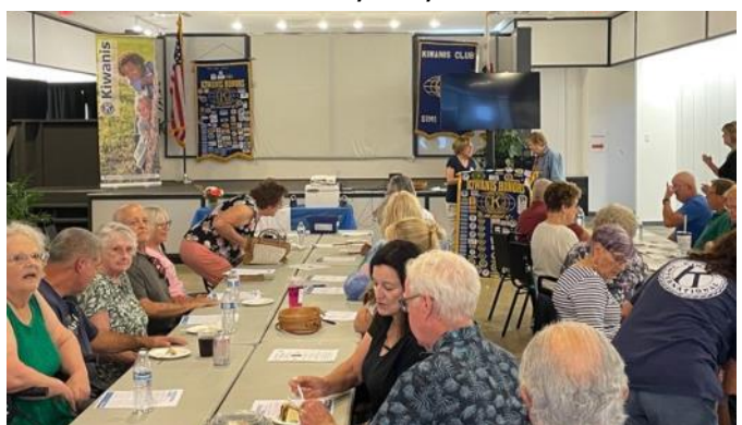
It was a full house at the Simi Valley meeting.