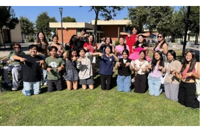
At the end, a well-educated group of KIWIN'S