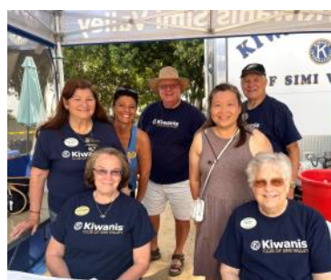
On a sizzling hot July 22-23 weekend, an intrepid group of Simi Kiwanians provided the only food and beverage service for Strathearn Historical Park's "Journey Through Time" event.