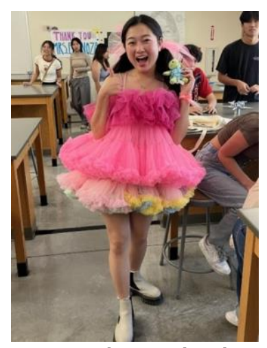
Cotton Candy was also there.