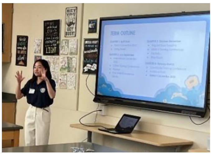
Governor Luci Wong presenting the term outline