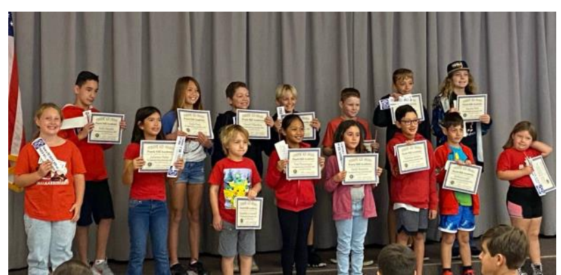
Moorpark has TERRIFIC Kids!