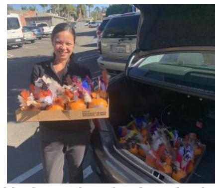
Ventura Kiwanis delivering pumpkin table decorations for the Salvation Army, Petit Ave. Thanksgiving dinner.