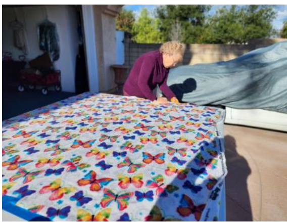
Gary and Karen work at cutting material for our No-Sew Blanket Program.