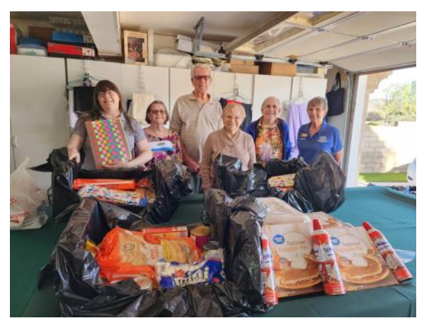
Santa Su continued their annual program of putting together Thanksgiving Baskets filled with dinner goodies, including turkeys, for needy families at a Simi high school.

Caroling with Simi Club at Varenita Senior Living