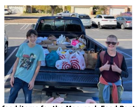
Campus Canyon Builders Club students collected over 600 food items for the Moorpark Food Pantry! Moorpark Kiwanians served Veterans and guests refreshments at the Veteran's Day Commemoration ceremony.