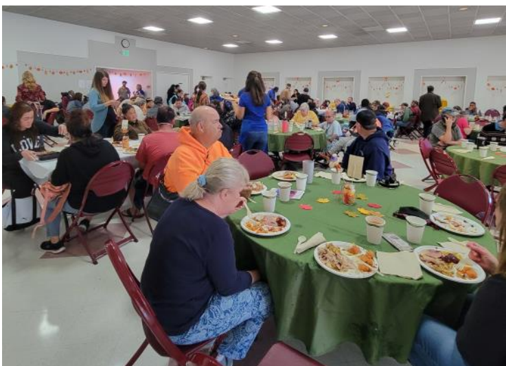
On Wednesday Nov 23rd, the Santa Barbara Club served a Thanksgiving meal to the developmentally disabled in our community.