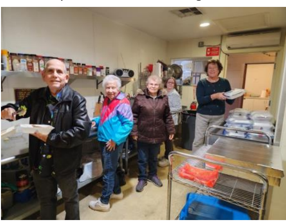
Members were out in full force to serve dinners of chicken pot pie, salad, veggies, and dessert prepared for the monthly service to help feed the needy at the Samaritan Center.