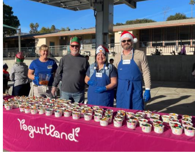
On Friday Dec 9th, Santa Barbara Kiwanians served treats to the 4th, 5th and sixth graders at Cleveland School in recognition of the awards they earned bringing up their grades and demonstrating their good citizenship.