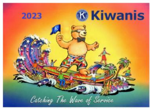
Kiwanis Rose Float Club