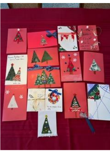
Our DATA Builders Club created Christmas cards for residents of a nursing home.