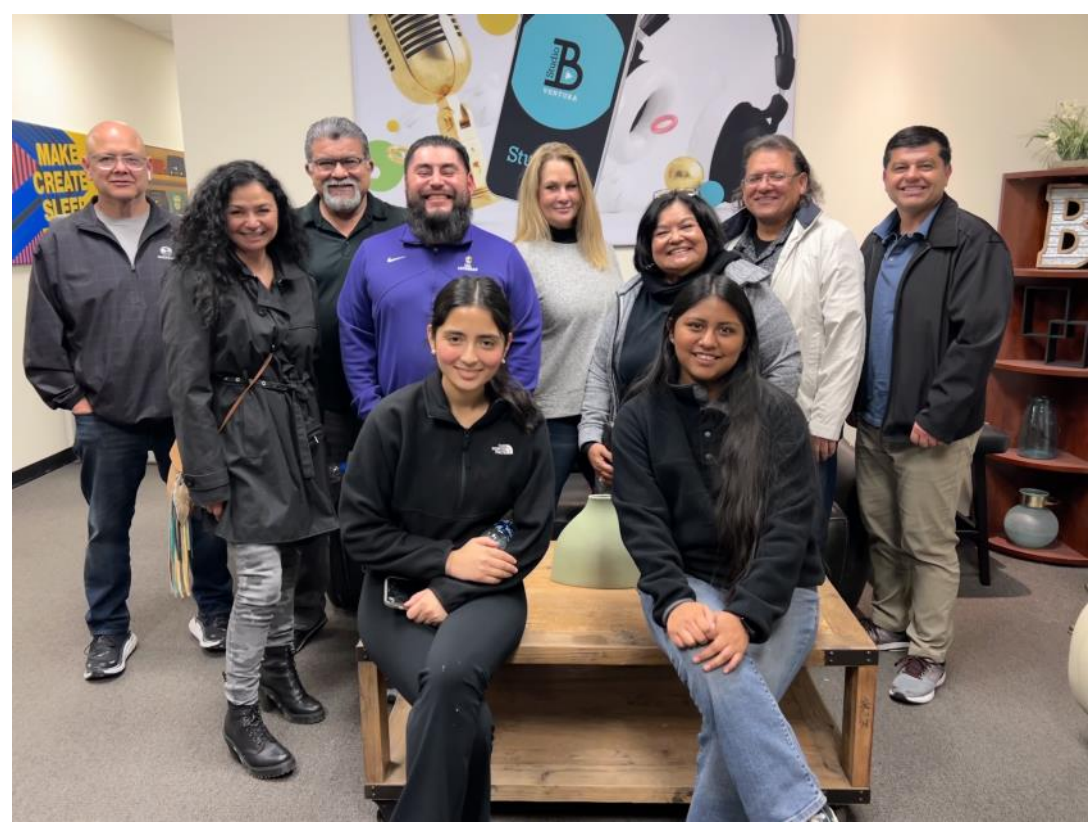
Our first meeting of the year was well attended and held at Studio B in Ventura. We worked on planning great fundraisers for our Key Clubs and other local youth groups.