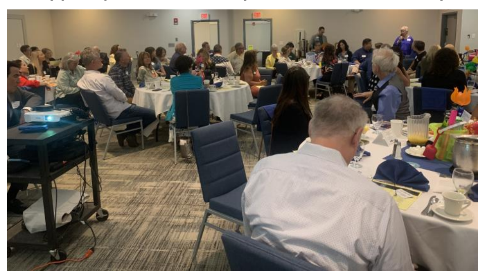
Ventura Kiwanis also participated in the Ventura Chamber of Commerce Connection Breakfast.