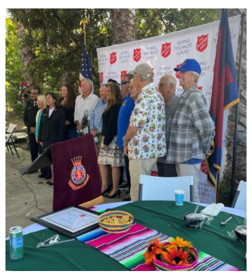
Members of Ventura Kiwanis recently participated in a celebratory dinner at the Salvation Army.