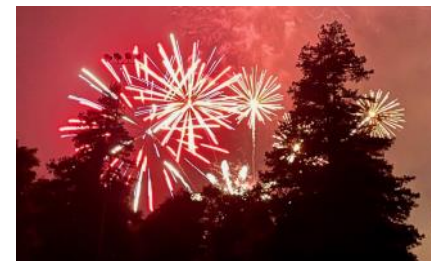
Simi Valley celebrated July 4th Kiwanis-style, with music, dancing, food, drinks, and fireworks. Fun for all ages!