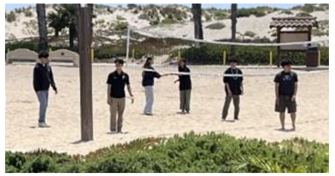
Key Club Div. 42W held their first DCM at Oxnard Beach Park. After finishing their business, they played a competitive game of volleyball on the beach.