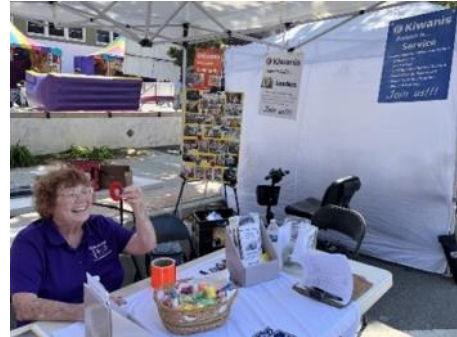
We set up an information booth at the Heritage Days, put on by the Camarillo Old Town Association. With help from our SLP Clubs we were also able to do over 80 hours of community service for the association, which exempted any fee for the booth. We gave a lot of small toys to the kids while we spoke to their parents about Kiwanis. We also used up a whole roll of car seat stickers at the event.