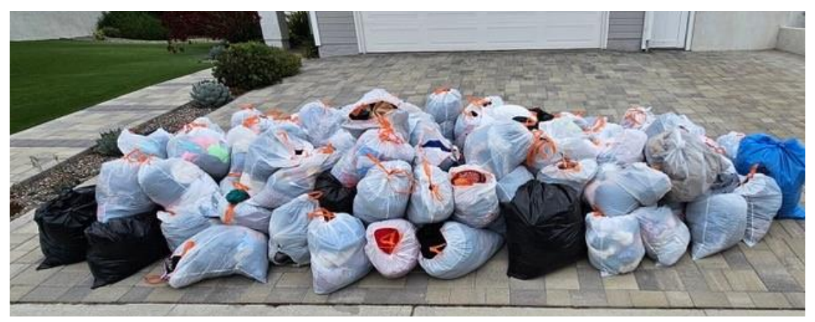
Our clothing drive was a success! 120 bags were collected.