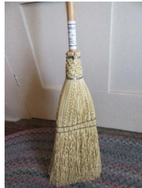
Handmade Corn Broom - $50 Made in the Canterbury Shaker Village