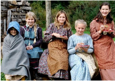
Woolen Shawl - $35 Let's keep our young volunteers warm Two shawls are available