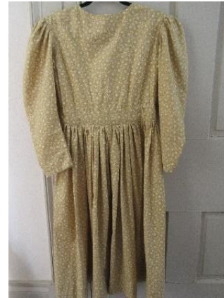
Conner Prairie Cotton Dress - $75 Conner Prairie Village in Indiana