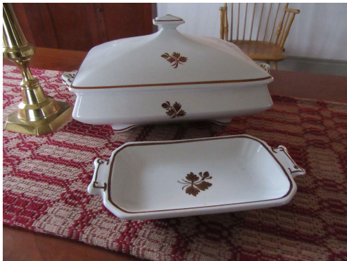
Small Tea Leaf Serving Dish $25 A Nice Addition to our Palour Set