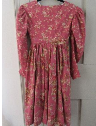
Conner Prairie Cotton Dress - $75 Costume for our Young Volunteers