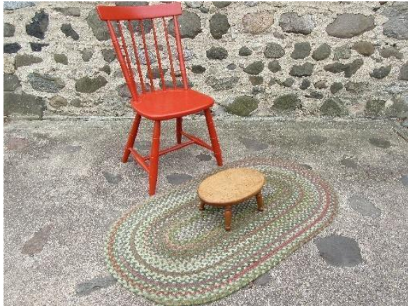
Green Oval Braided Rug - $35 Used on the Pantry Floor