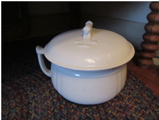
Hired Man's Chamber Pot $75 Conveniently Located under his Rope Bed