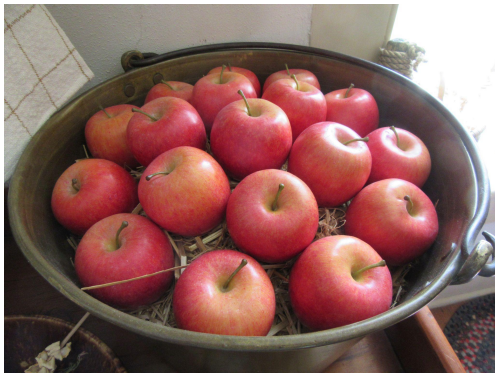
Artificial Apples $50 We're Ready to Make Applesauce