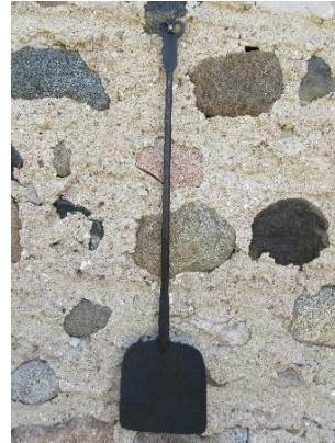
Hand-Forged Ash Shovel/Peel - $75 An Essential Tool in Hearth Cooking