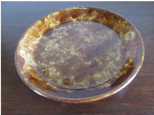
Bennington Yellow Ware Pie Plate $40 Ready for one of Mary's Fruit Pies