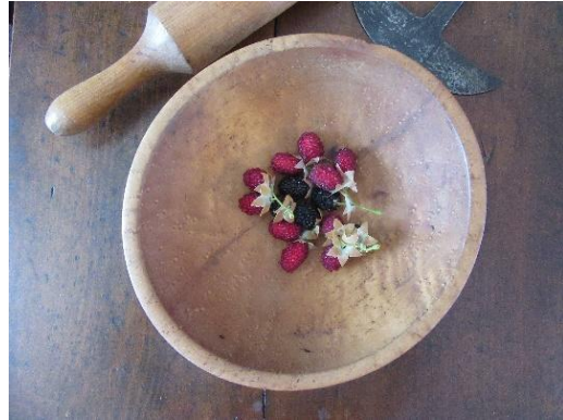
Birds-Eye Maple Bowl - $75 Used for Food Preparation in the Pantry