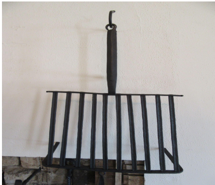
Hand-Forged Iron Hearth Broiler $150 Late 1700s to early 1800s