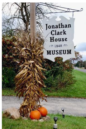
Museum Roadside Sign $600 Look for the Sign on Cedarburg Road