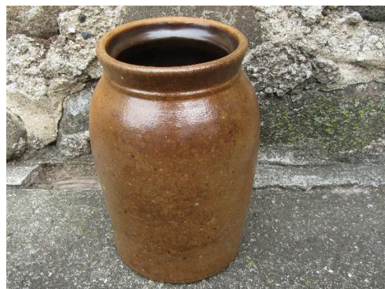
19 th Century Storage Jar $50 For Fall Food Preservation