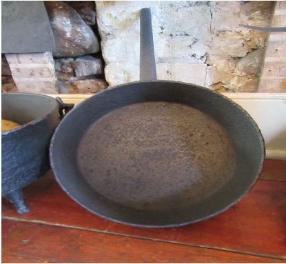
Cast Iron Skillet for Hearth Use $150 Mid to Late 1700s

Your sponsorship will help us tell the fascinating story of life in the mid-19th century