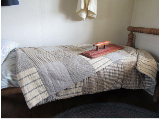
Quilt on Hired Man's Bed $175 Warm Contemporary Craftsmanship