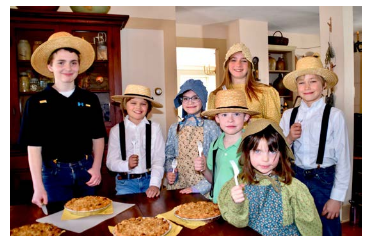
Outpost pies! Tested by our JCH Young Historians