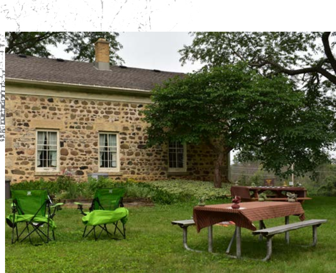
This is a special event for JCH Friends and Donors. Not a JCH donor?

Visit our Donate page at jonathanclarkhouse.com