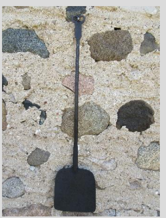
Hand-Forged Ash Shovel $75