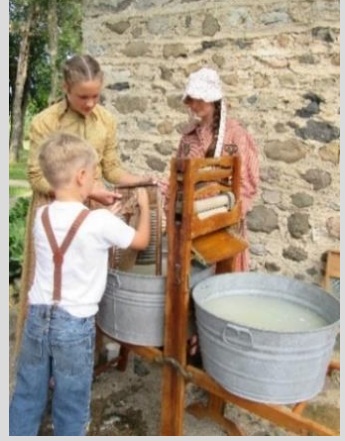
Clothes Washing Equipment $200