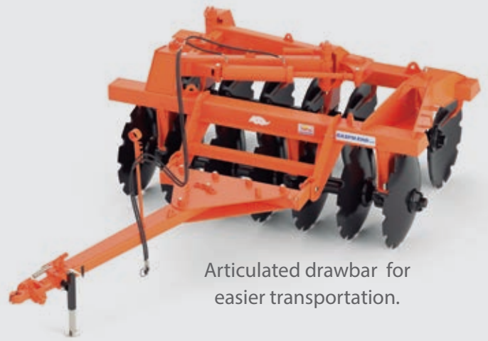
Articulated drawbar for easier transportation.