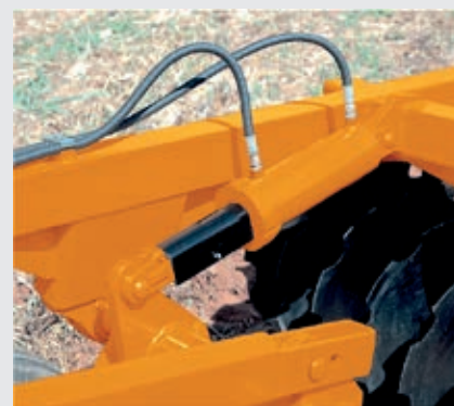
Cylinder lock for safety transportation.