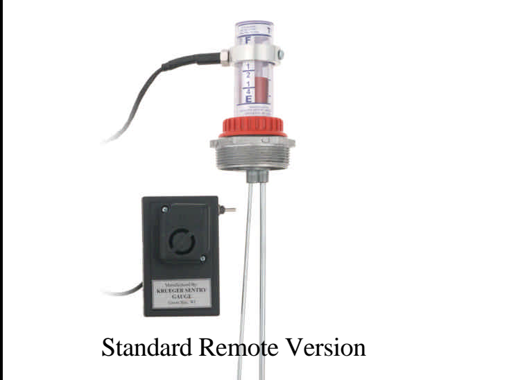
Standard Remote Version

Krueger Sentry Gauge 1873 Siesta Lane Green Bay, WI 54313