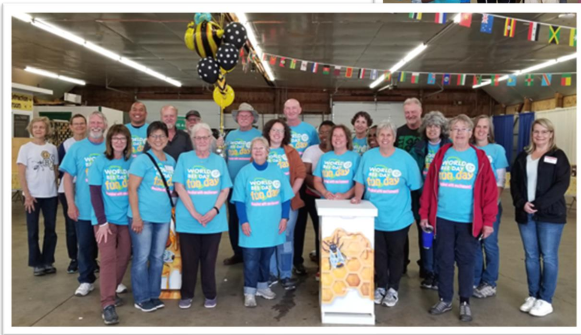
Thank you for your support!