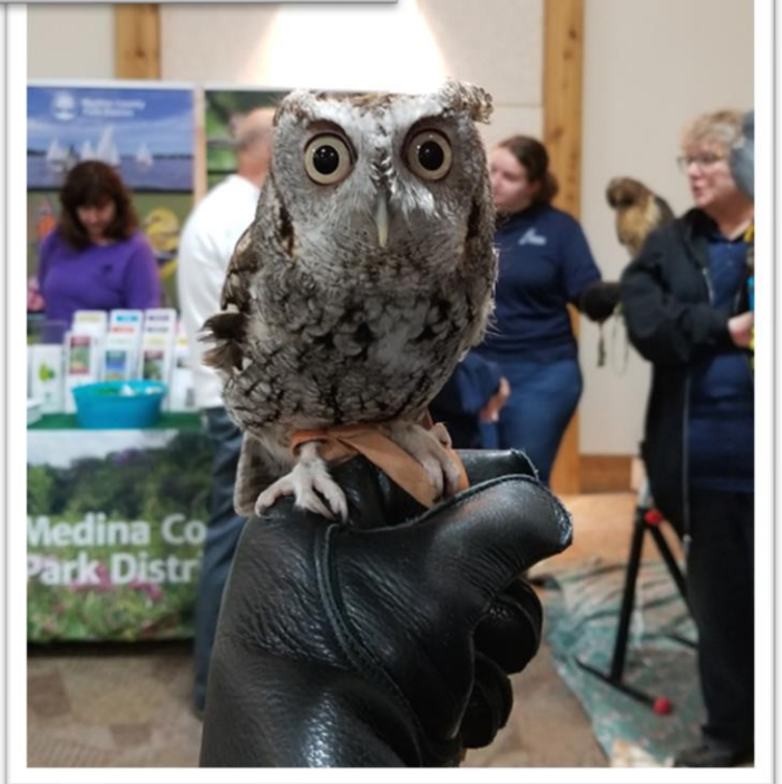
Once again, an owl is the star of the event!