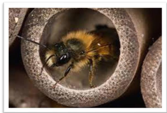
Mason Bee at Work

And occasionally curse at! Earlier this year Mason Bees started using my garage for nesting sites. Every small opening was being plugged with mud to raise their young. They especially took a liking to wall outlets and extension cords. They filled the ground plug holes solid. I had to remember to be very careful while trying to clear out the holes!