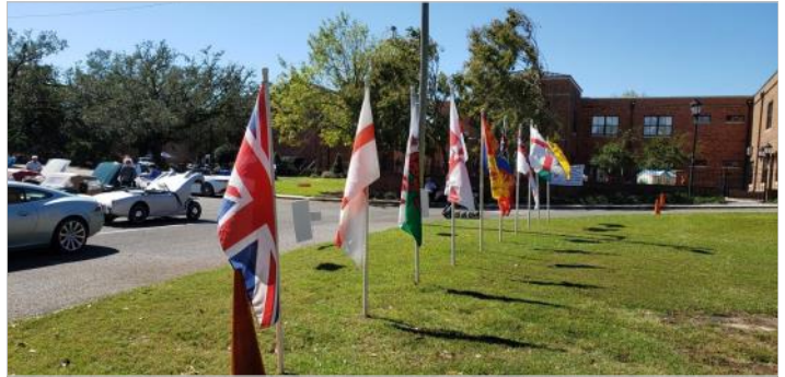
MGMG flags at the SABCC show

dues are $30.00 per year. And, like the other Brit clubs, you do not need a British car or bike to join.