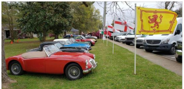
2019 Fairhope Arts and Crafts Festival

MGMG is proud to host two popular regional events (Brit cars only) that include inviting SABCC and PBCA to attend with us. These events are the Fairhope Arts and Crafts Festival (every March) and the Silverhill Veteran’s Memorial Car Show (every May). MGMG puts in a lot of hard work reserving show sites, buying insurance, preparing show sites, cleaning sites and handling entrant parking. The Fairhope Arts and Crafts event is a car “display” and is free for participants [and offers the best parking at the Festival-Ed.].