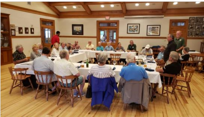
June 24, 2023 club meeting at Fairhope Yacht Club.

Did you know that there is a dedicated group of British car enthusiasts right here on the Eastern Shore of Mobile Bay? Our club members own such classic marques as MG, Triumph, Jaguar, Austin Healey, Mini Cooper, Land Rover, Sunbeam, Morgan, and others.