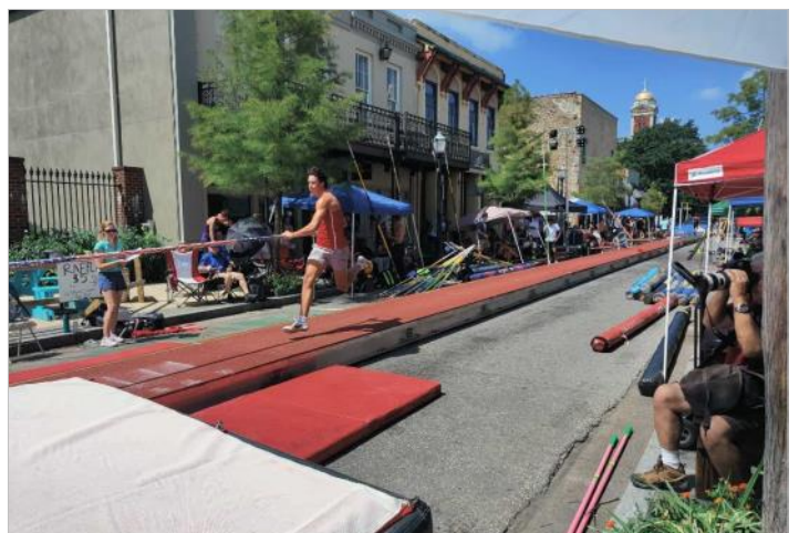
Pole vaulting on Dauphin St.

quite a crowd and many young athletes from local colleges and out of state. How nice it was to see talented young men and women enjoying this highly competitive sport. [ The next Cars, Coffee, and Conversation is Aug. 19 at Derailed Diner-Ed. ]