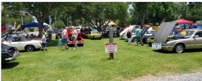
2023 Silverhill show

tends local area car shows (British and American) and participates in parades, including the Fairhope Veterans' Day and Lillian Christmas parades.