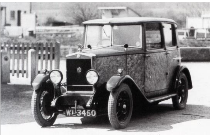
The "Owld Speckled 'Un"

In fact, MG was such a force that a British brewing company developed a beer to celebrate the 50th anniversary of the MG factory in Abingdon in 1979.