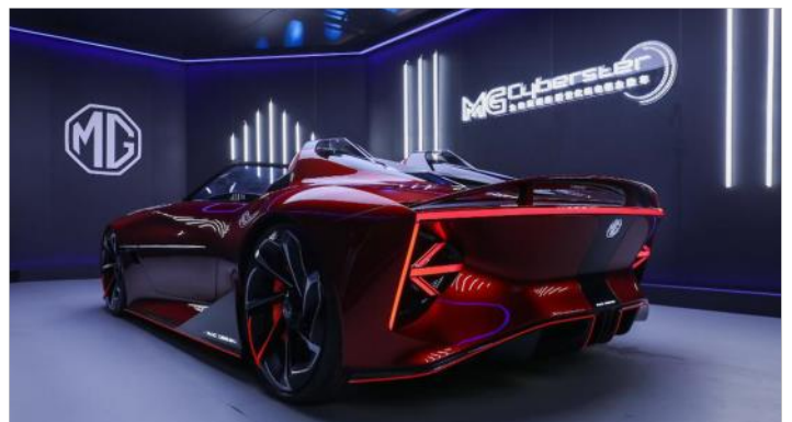
The MG Cyberster, an electric roadster.

quite a crowd and many young athletes from local colleges and out of state. How nice it was to see talented young men and women enjoying this highly competitive sport. [ The next Cars, Coffee, and Conversation is Aug. 19 at Derailed Diner-Ed. ]