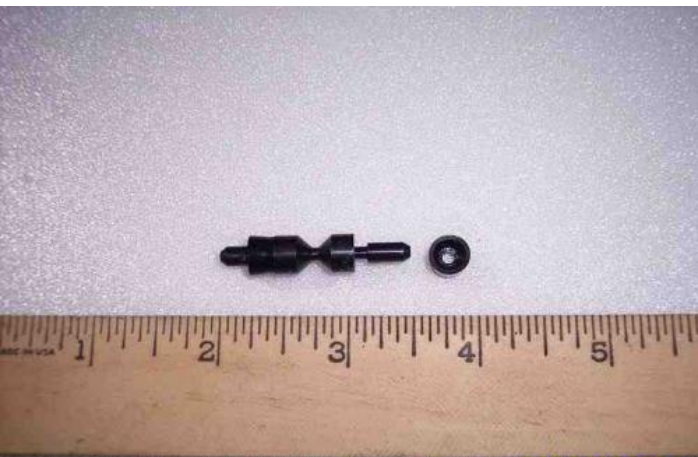
Proportioning valve (cup-type)

ply. Importing a later-model British car without one will get you in trouble; Uncle Sam will make you convert it to the U.S. standard, as