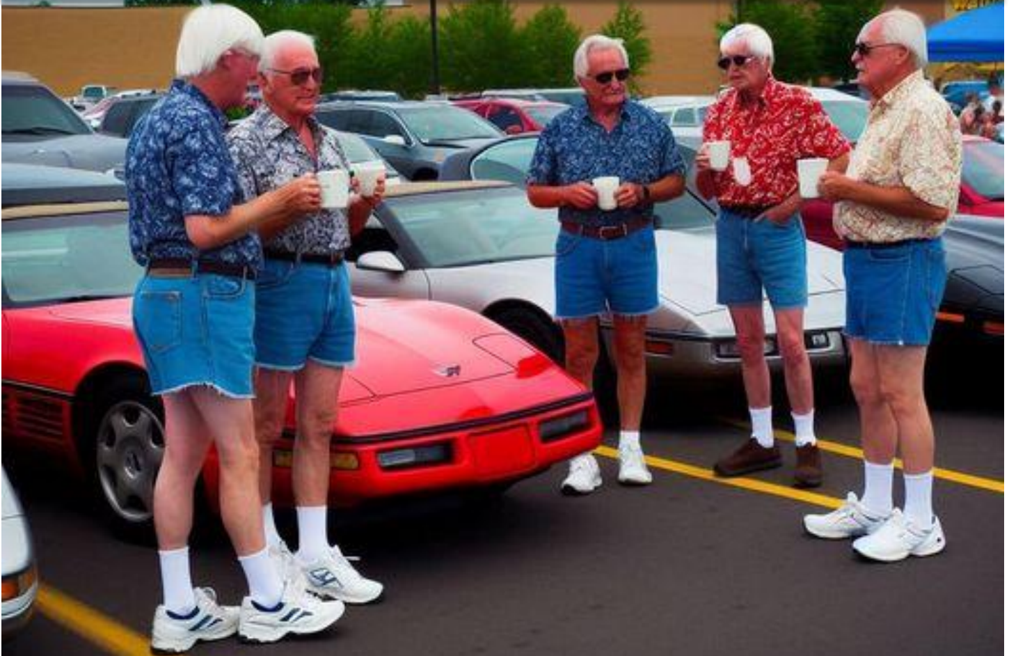
Meanwhile, at the Corvette section of a "Cars and Coffee..."

And now, for something completely different . . .