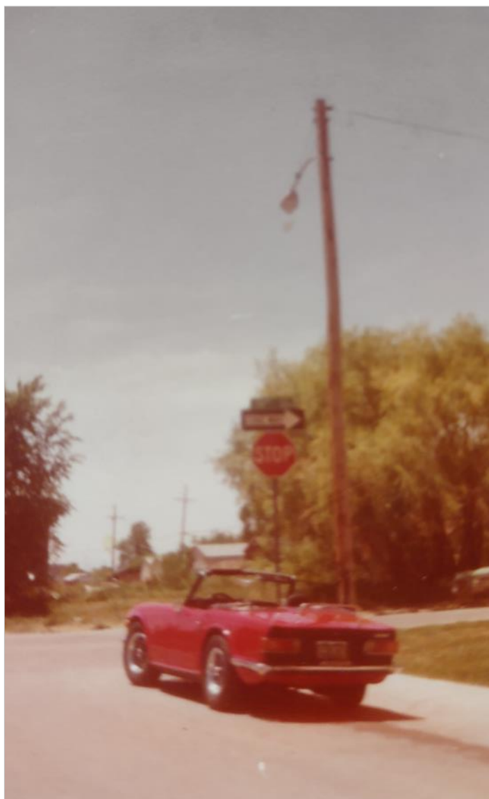
The finished car on a slightly warmer day.