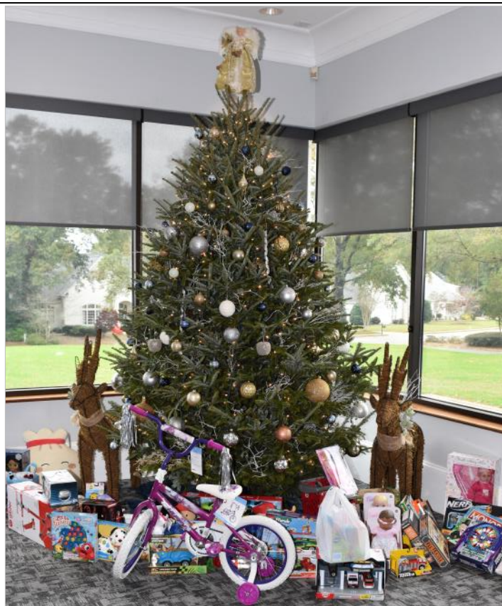
Gifts donated by SABCC members for the Salvation Army toy drive.