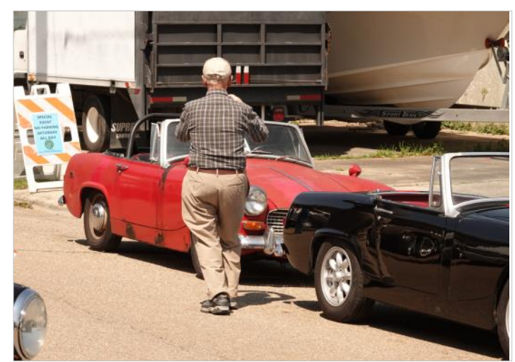
President Cummings' Sprite was ready for its close-up

Mother Nature cooperated providing a springlike day with sunshine and a slight breeze, just enough to make everyone feel comfortable as they walked around and talked to owners who were very willing to share the history of their cars, and many also allowed young children to sit in their cars for a memorable photo [ Good on those owners!-Ed. ]