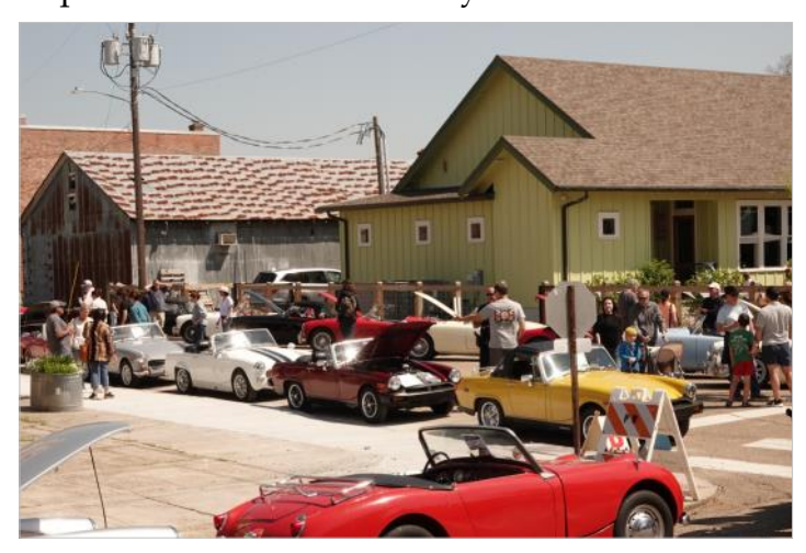
Covington's streets were lined with cars

Our small convoy arrived safely and everyone was quickly directed to the designated parking area for their make/model. The quaint side streets with numerous arts and crafts shops, antique stores and wide variety of hostelries to sat-