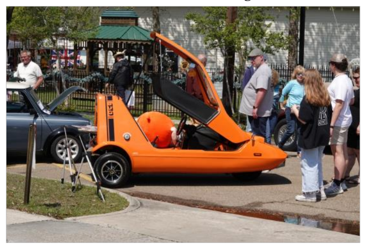
Congratulations to BMCNO for having the courage to make the move to Covington, let's hope they will be back in the same location next year.

Yes, there were winners and losers but the most important aspect of attending a British car show is having a great day out, meeting old friends and making new acquaintances. And, who doesn't love the Reliant Bond Bug [see below-Ed.]?