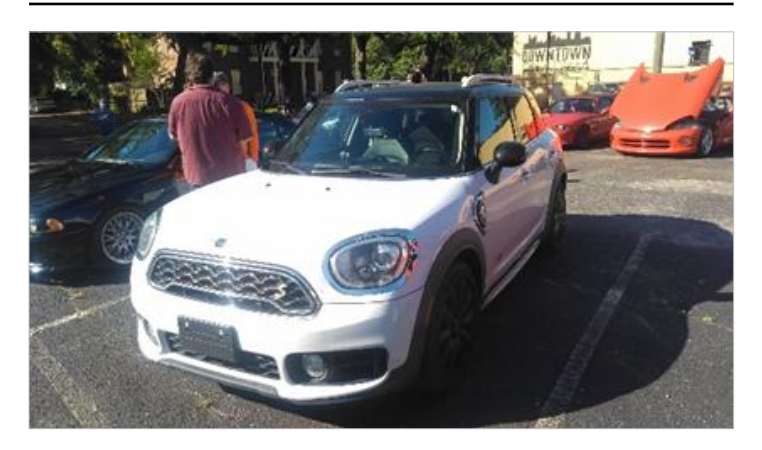
Modern MINI Countryman