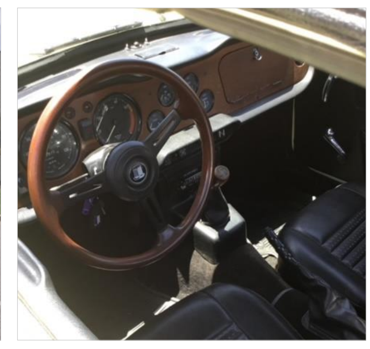
From the owner:

I have owned my 1971 Triumph TR6 for nearly 40 years. It has always been garaged. The car received a comprehensive restoration at purchase. During the restoration process the front and rear fenders, inner and outer rockers, floor pans, doors and trunk lid were replaced. The frame was reinforced in the area that the rear suspension attaches to it and the "tee shirt" was replaced. The car had recent repairs including a new battery, new fuel tank, new tires, overhaul of the carburetors, new spark plugs as well as replacement of the rear brake cylinders and brake shoes. The car shows nicely and the interior is in good condition. Selling price is $17,000 and is located in Foley/Gulf Shores area. If interested, respond by Messenger or email at ronmarw@hotmail.com. Serious inquires only please.