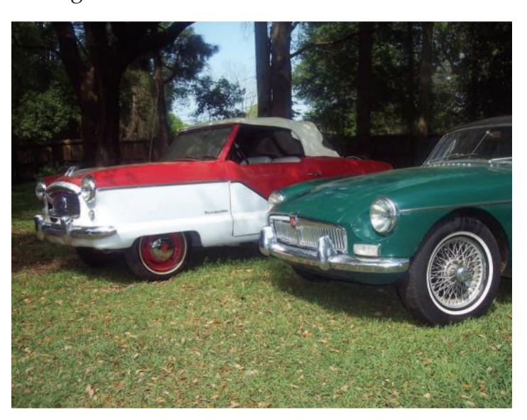
The Met with a nice-looking chrome bumper MGB

A new-looking Nash Metropolitan was just purchased by a future member (I hope, I'm trying!). My repairs on the Met were the tedious kind: electrical, making the turn indicators and other lights work. Since the turn signal switch is built into the horn button, it is a pain of careful soldering.