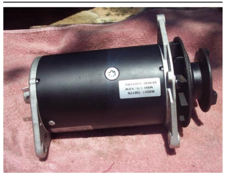
Quality Asian generator

fields were rotten and shorted. But for around $90.00 I bought a new one - no exchange, no freight. eBay has a perfect solution, with this seller having a 99.9% satisfaction rating. The owner saves a lot. Please don't make the Chinese mad.