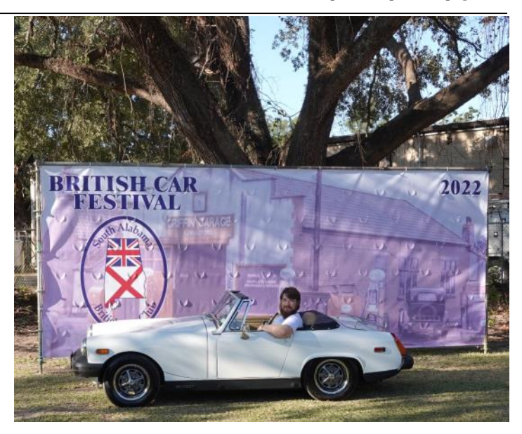
The author in his MG at the 2022 British Car Festival.

The short three-mile drive to Lake Massabesic to the east side of Manchester, NH was a bit chilly but nothing a blanket and a warm coat couldn't combat. We pulled up beside the water and pulled out our fancy dinner, careful not to el-