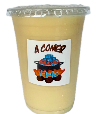
Virgin Piña Colada