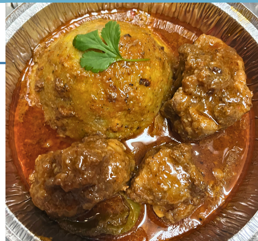
Choice of Meat with Homemade Seasoning