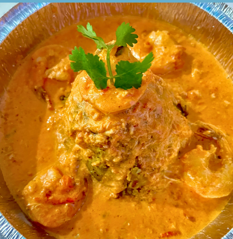
Creamy Tomato Sauce & Choice of Meat