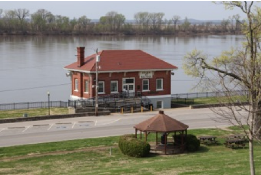
The best place to have a car show by a dam site. Lets fill it up on Sept 17th for the 27th Annual British Car Show.

See the attached editorial”How Hard Can it Be? Al Salhoff 812-618-8399 alcami2000@yahoo.com