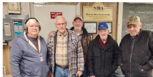
The first members to use the new system!