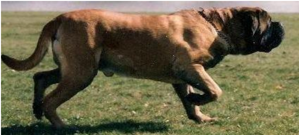
Worcester Lad of Bredwardine "Aram"