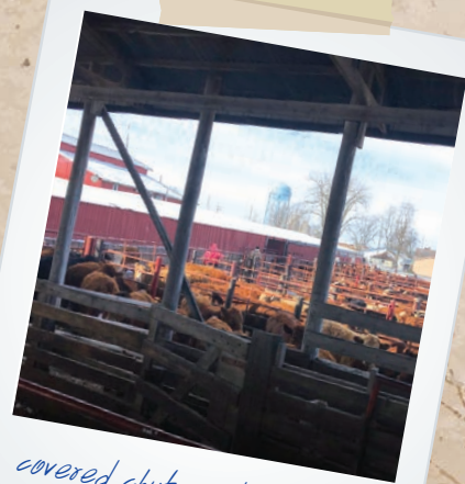
covered chute and north pen