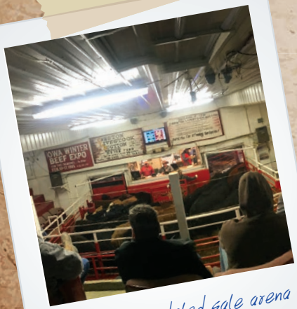
recently remodeled sale arena

Livestock Marketing Association can assist buyer in helping meet federal and state licensing, bonding, and other regulatory requirements. For assistance, contact LMA's legal team at 800-821-2048."