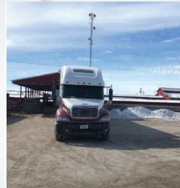
Covered loading and unloading facility

A portion of the permanent pens in the SW portion of the property are on ground leased from BNSF Railroad. The large brick building and vacant land it sits on south of yards is also part of railroad lease, transferable to the new buyer.