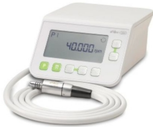
Table-Top EA-53 Electric Motor Kit