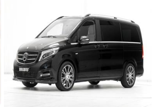
(Name) and (Name) will pick you up from the Baileys hotel and take you to the Tower of London