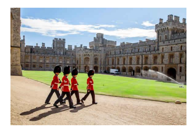
\ensuremath{(\mathsf{Name})} will take you through Windsor Castle and then take you through the town.