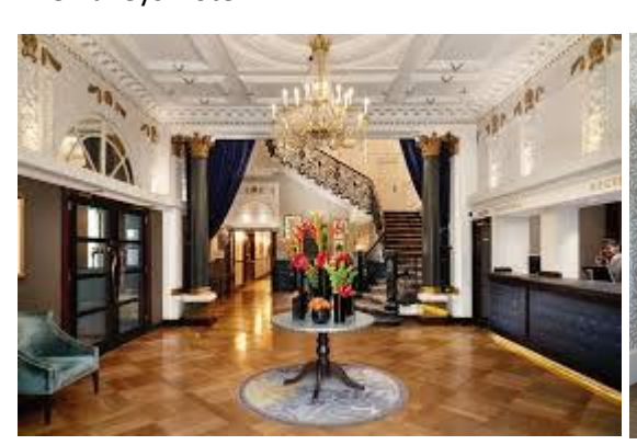
The Baileys Hotel