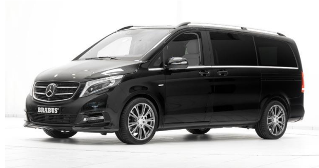
(Name) drives one of these