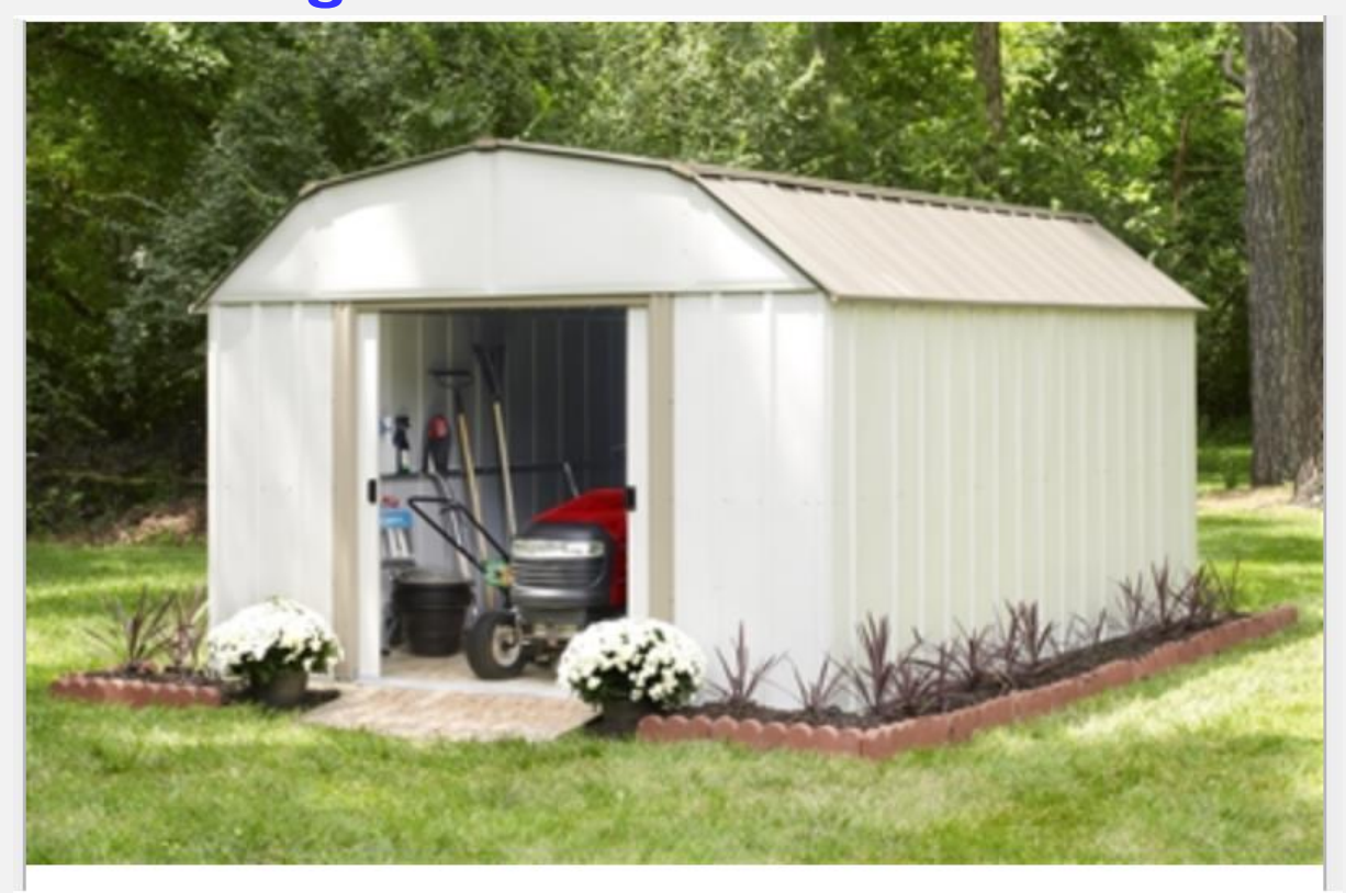
10' x 14' Electro galvanized steel Dakota shed.