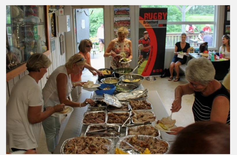
Over-35 Rec. Soccer_AGM_Sep. 21_2018