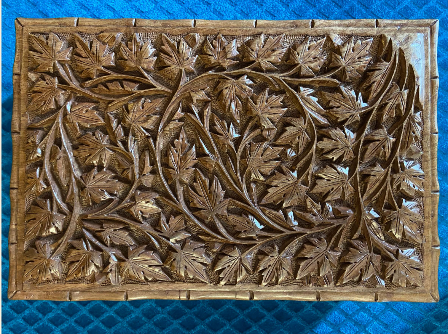
Maple Leaf Design Dimensions: L 30cm W 20cm H 10cm