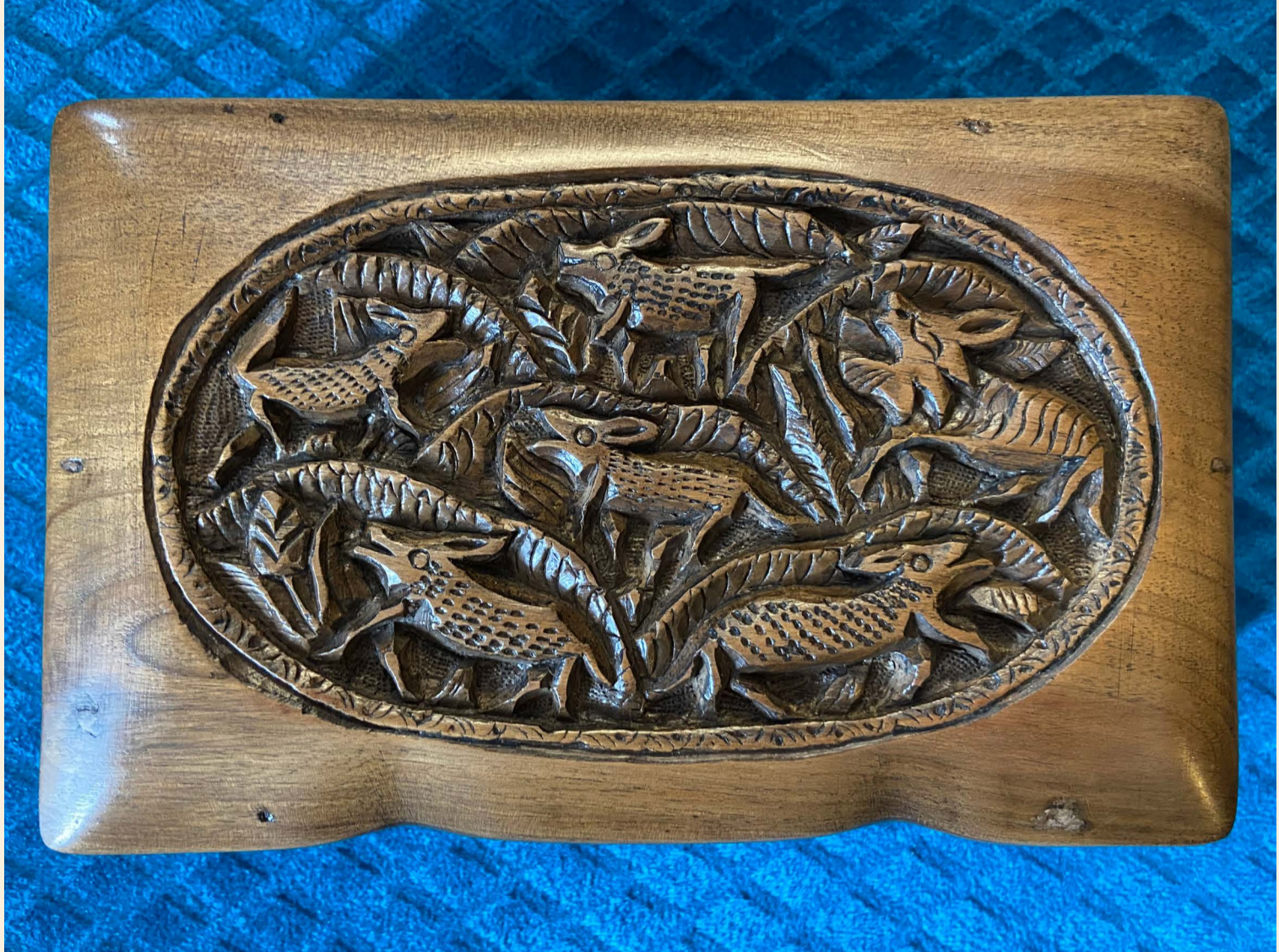
Animal Design Dimensions: L 20 cm W 13cm H 7cm