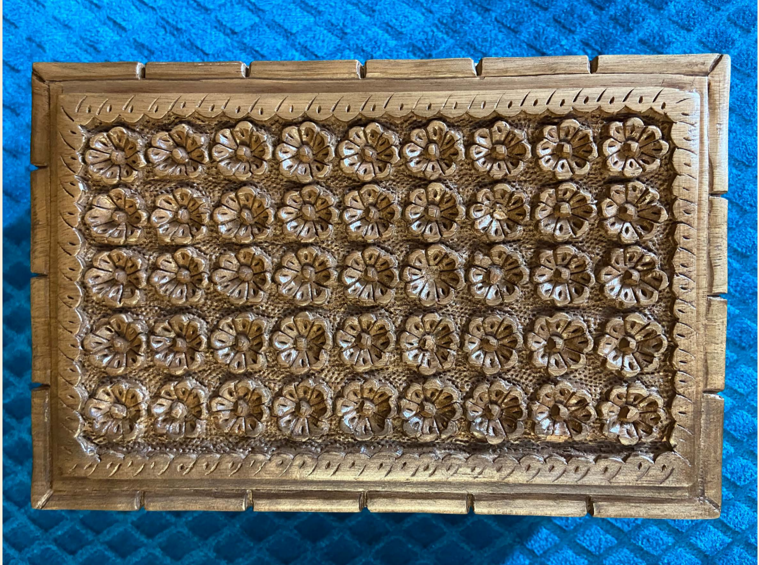
Pansie Flower Design Dimensions: L 23cm W 15cm H 9cm