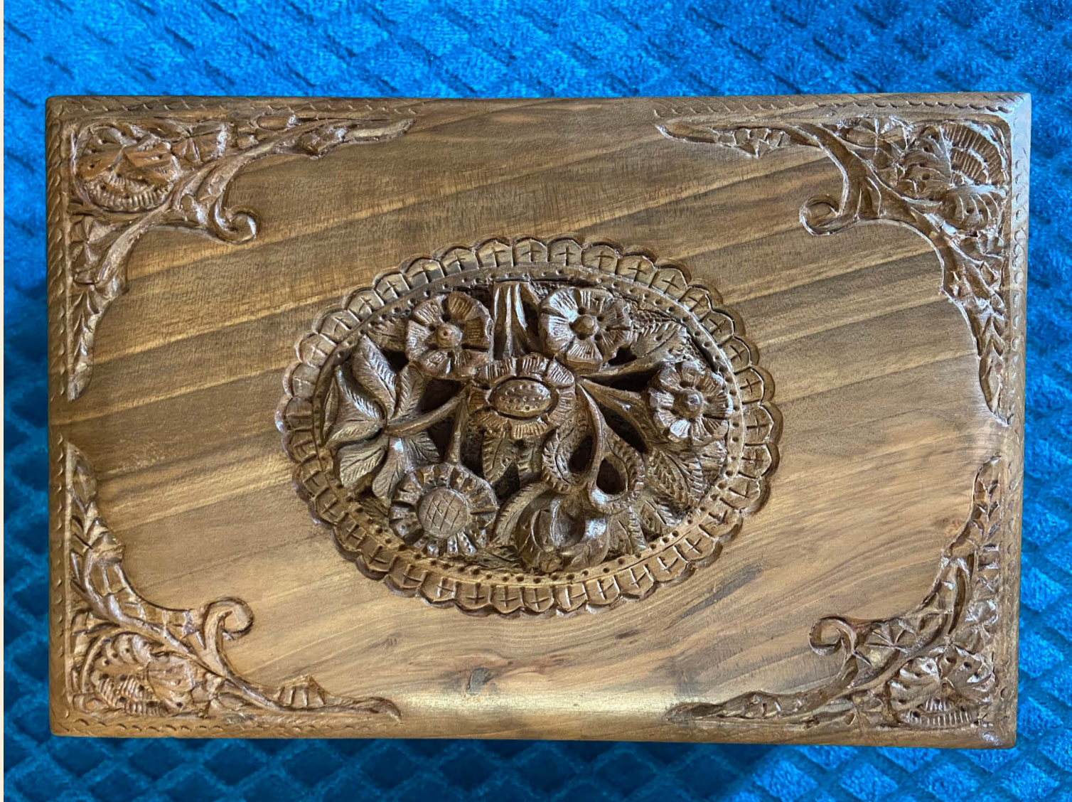
Pansie Flower Design Dimensions: L 23cm W 15cm H 9cm