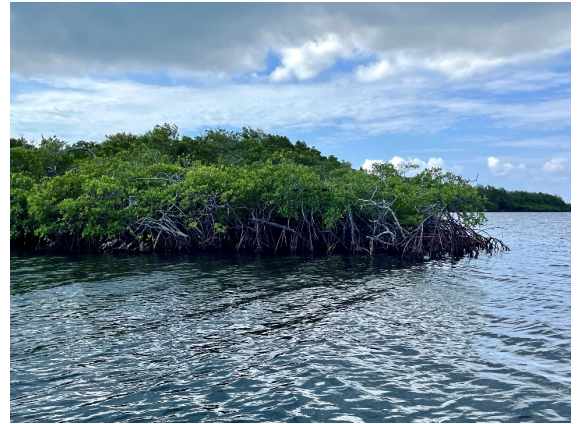
Central Mangrove Wetland – Cayman Islands