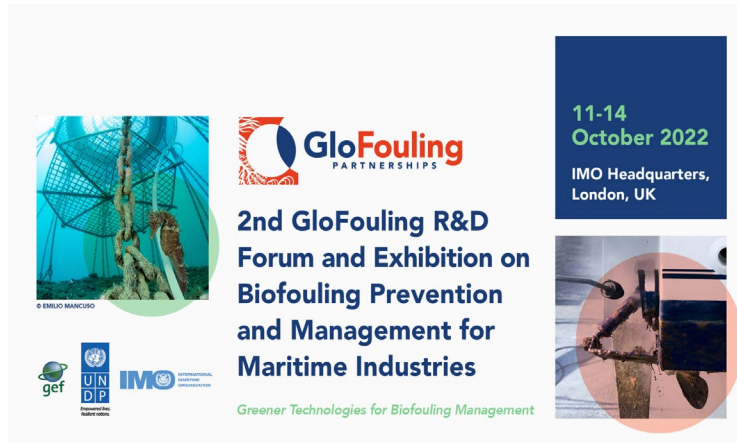
IMO 2022, 2nd GloFouling Partnerships R&D Forum and Exhibition on Biofouling Prevention and Management for Maritime Industries Greener Technologies for Biofouling Management. For more photos of the event, visit the Flickr gallery here

The 2nd GloFouling Partnerships Forum and Exhibition on Biofouling Prevention and Management for Maritime Industries (11-14 October) was held at the International Maritime Organization (IMO) Headquarters, bringing together government delegates, researchers, leading scientific experts, technology developers, and global representatives from maritime industries such as shipping, ports and harbours, aquaculture & fishing, offshore oil & gas, deep sea mining and ocean renewables.