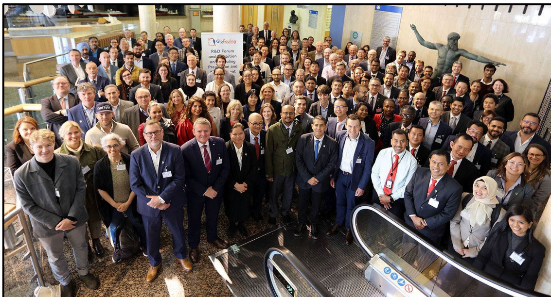
IMO 2022, 2nd GloFouling Partnerships R&D Forum and Exhibition on Biofouling Prevention and Management for Maritime Industries Greener Technologies for Biofouling Management. For more photos of the event, visit the Flickr gallery here

Participants discussed greener technologies for the management of biofouling and ways of tackling transportation of invasive aquatic species to protect marine biodiversity. Biofouling is the accumulation of aquatic organisms on wetted or immersed surfaces such as ships and other offshore structures.