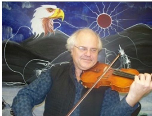
(Artwork with permission of Chandler McLeod)