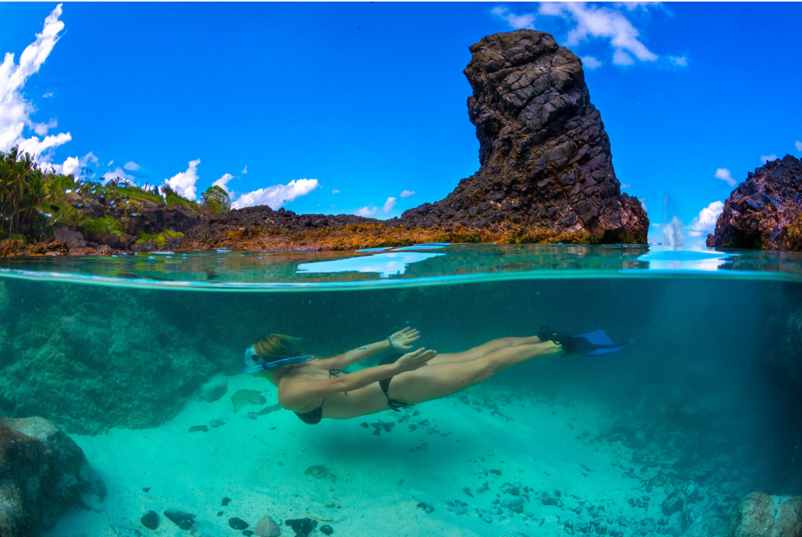
Whitsunday Island - Hamilton Island in Queensland