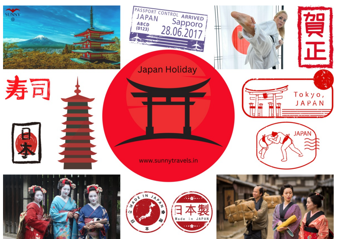
Japan is a nation of innovation and progress, yet is passionately protective and proud of its culture. Temples, shrines, peaceful gardens and traditional customs, co-exist with towering skyscrapers, futuristic architecture, speeding bullet trains and a quirky pop culture. Our curated holiday itineraries are well illustrated & planned to meet your requirements with painstaking details each & every time.