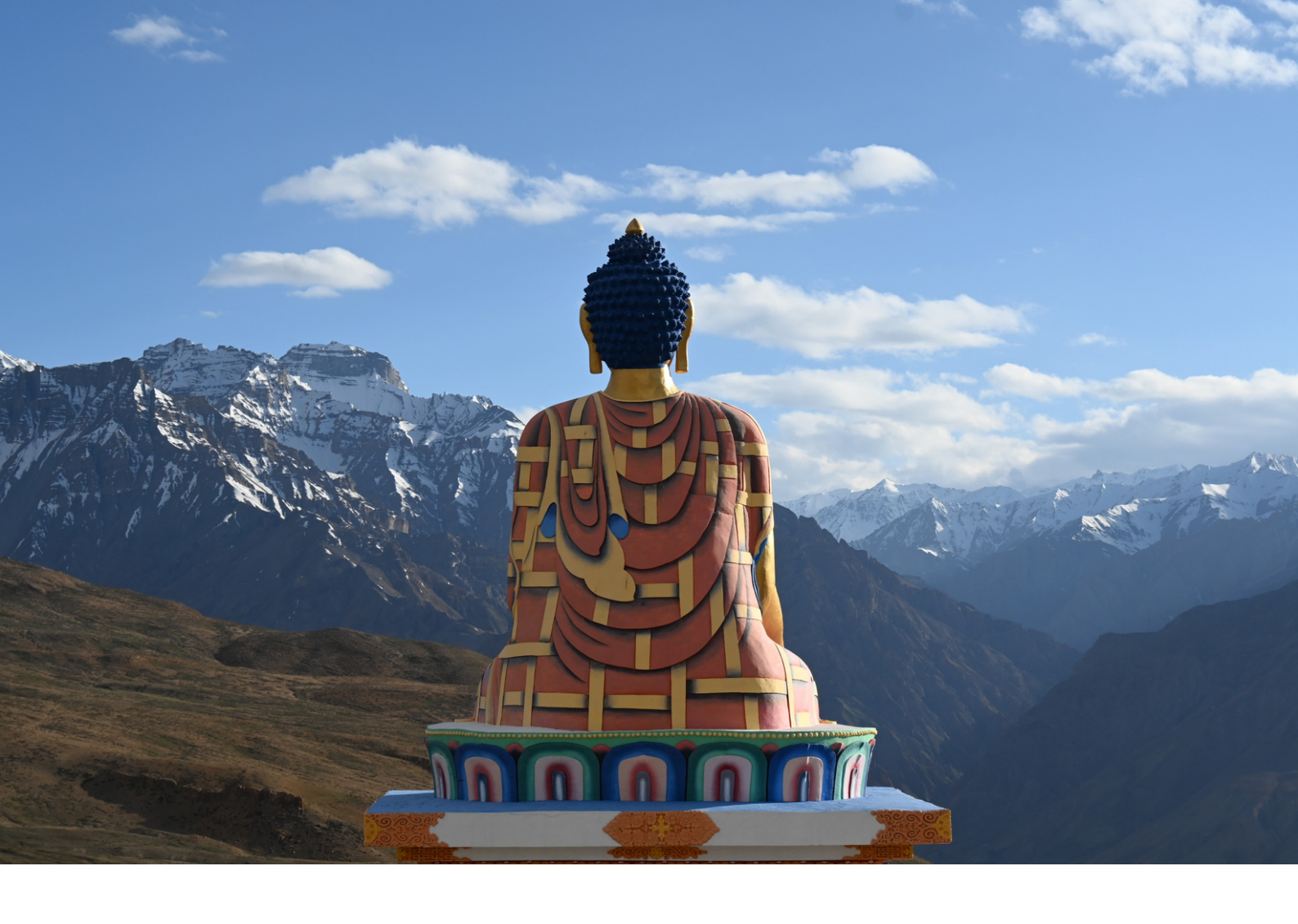
Mesmerising view of the region in Spiti Valley